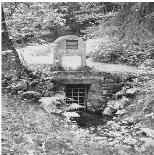
Fig. 1. Hereditary adit Kaspar Pflug, Horní Slavkov Rys. 1. Sztolnia Kaspar Pflug, Horní Slavkov

From the point of view of chemical composition, the classification of mine waters is especially difficult. There are numerous schemes of classification based on one or several parameters of MW, e.g. based on major cations and anions. Next, MW can be classified on the basis of the pH value [7], the pH value and concentration of Fe^{2+} and Fe^{3+} , the pH value and total dissolved metal content, etc. [8]. A special category of MW is represented by Acid Mine Drainage (AMD). AMD is charac-