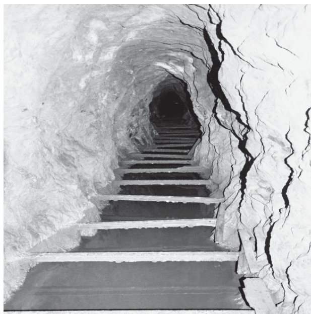
Fig. 2. Hereditary adit in Příbram Rys. 2. Sztolnia w Przybramiu