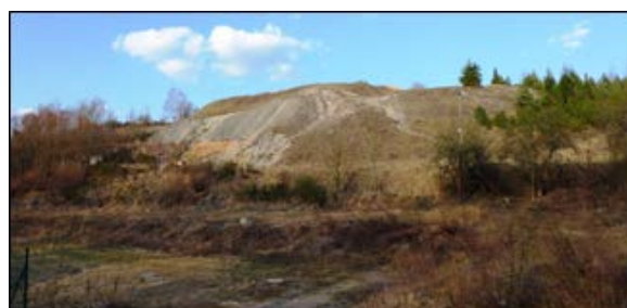
Fig. 2. Front view at heaps from southwest