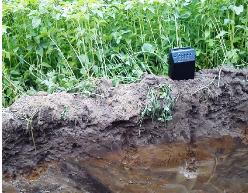
Fig. 3. The profile of the soil on which sunflower is grown mixed with legumes. Visible open canals hollowed by earthworms with crop roots growing in them vertically. Author: M. Grzesik

An important aspect of research in agro-ecotechnology is the development of a monitoring system for the diseases of energy crops, the diagnosis of their perpetrators, and the timely performance of plant protection treatments. The selection of stimulants of plant growth and their resistance to diseases and adverse agrometeorological conditions is also an important aspect. The problem of protecting energy crops against pests is very complex as it should concern the use of biological agents that effectively combat the perpetrators of diseases, while at the same time positively affect biomass yield and are environmentally friendly [8, 20, 21].