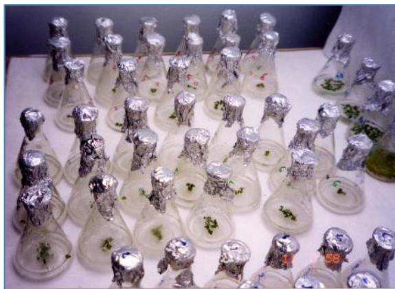
Fig. 1. Bioindication test of the water used in ecological cultivation of plants using the Spirodela oligorrhiza bioindicator Author: Z. Romanowska-Duda

In Poland, the use of plant biomass has a great advantage over other renewable energy technologies, due to its ability to be produced on a large acreage of marginal (weak) soils, excluded from food production. There is a wide area where it is possible to improve environmental performance and energy efficiency using modern agrotechnology and, in the later stage, subjecting the raw material to carbonation (high temperature drying of plant matter in reactors), with synchronized bioindication of environmental monitoring to protect natural resources (Fig. 1). Producing the required biomass potential on soils of very low quality, without the use of developed, high-performance agrotechnologies, will be very difficult. Plants in these unfavorable conditions yield very poorly and their production uses large amounts of toxic fertilizers, which is unprofitable and additionally has a negative impact on the environment [4, 12-14].