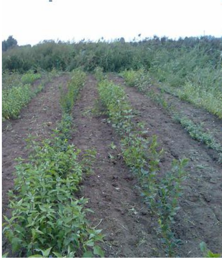
Fig. 6. Field cultivation of plants in low quality soil. From the right: unfertilized and fertilized with three different doses of certified sludge from a municipal treatment plant.