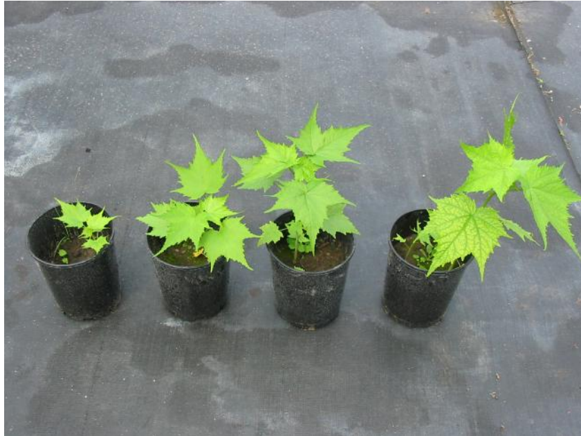
Fig. 4. Sida (Sida hermaphrodita) plants grown on peat soil. From the left: unfertilized and fertilized with three different doses of certified sludge from a municipal treatment plant. Author: M. Grzesik.