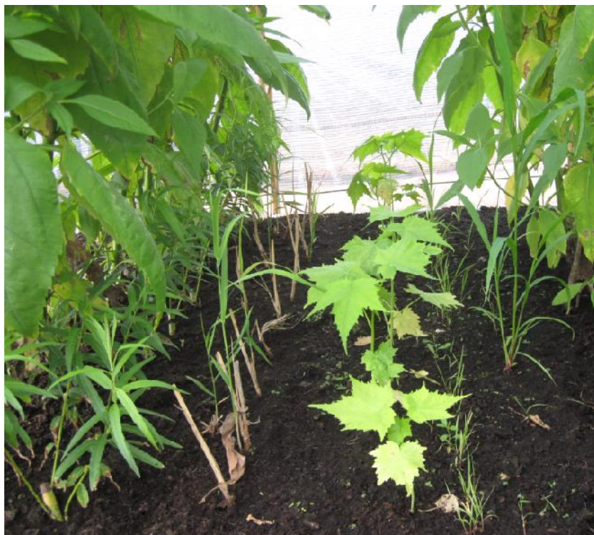
Fig. 6. Energy crops grown on soil contaminated with cadmium. Author: Z. Romanowska-Duda

Environmental profits from the application of phytotechnology lead, inter alia, to: (i) increasing the adaptive resilience of the ecosystem and reducing the effects of human activities, (ii) preventing pollution release and environmental degradation, (iii) monitoring pollution and environmental processes to reduce environmental degradation, iv) remediating and rehabilitating degraded ecosystems, and (v) using environmental quality indicators for monitoring and evaluating the condition of the environment [28].