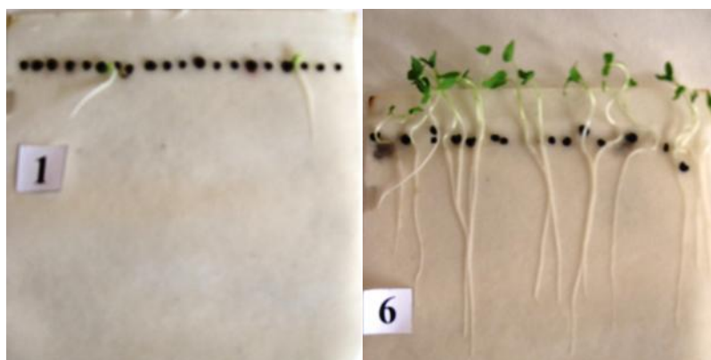
Fig. 2. Sprouting seeds of the garden tree-mallow ( Lavatera thuringiaca L.) of the Uleko variety after 8 days after planting on paper substrate moistened with distilled water. Seeds not tanshied (left) and after pre-sowing scarification (right).

destroy by mechanical and chemical treatments. Performing a spectrum of treatments at the same time is possible once the plants have reached the right development phase, which ensures pre-planting seed and seedling conditioning. The use of pre-planting methods to improve seed value also allows for decreasing the amount of material to be sown and increases the plant's resistance to environmental stresses, resulting in increased profitability of their production. In addition, accelerated root emergence and growth, being a consequence of the refinement, also allow plants to be grown under conditions of drought that are often present in the presently changing climate. The seedling/sowing of such seeds/seedlings in periodically wet soil allows for quick root overgrowth into the deeper layers of the ground, which makes the rooted plants independent of the subsequent drying of the surface layer [15, 16]. These data point to the validity of conducting multiplex research in the Renewable Energy Sources Technology Transfer Center in terms of improving the planting value of the energy crop propagation material, many species of which belong to the sparsely germinated perennial plants (Fig. 2) [17].