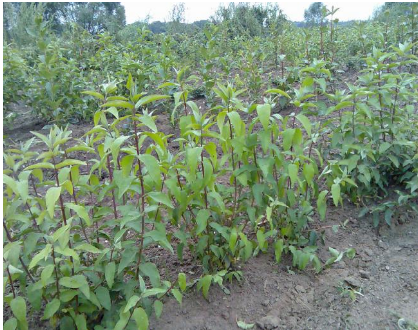
Fig. 5. Field cropping in low quality soils fertilized with various doses of certified sludge from a municipal treatment plant Author: Z. Romanowska-Duda.