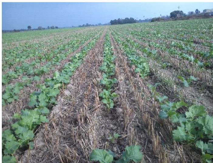
Fig. 8. Rape seedlings cultivated in the plowing-free system. Author: M. Grzesik

Increasing the profitability of energy crops, in addition to the methods of ecological fertilization, foliar application of biological agents, non-toxic cyanobacteria and chlorophytes, also requires the development of new agro-technical methods. One of them is, for example, the no-plow cultivation of plants, which is more economical than traditional plow-based systems. However, it requires costly specialized equipment, which is easier to depreciate in large area farms, and these should include energy biomass production companies. The conducted microscale studies based on the collection of the RES Technology Transfer Center will indicate the usefulness of this method in the cultivation of the energy crops gathered.