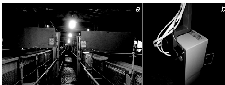
Fig. 1. RLP-21T at the conveyors 2 and 2A, Balkhash Concentrator. Conveyor gallery with the OMS installed (a) and ore monitoring station RLP-21T (b) Rys. 1. RLP – 21T na przenośnikach 2 i 2A, koncentrator Balkhash. Galeria przenośników z zainstalowanym OMS (a) i stacją monitorowania rudy RLP – 21T (b)