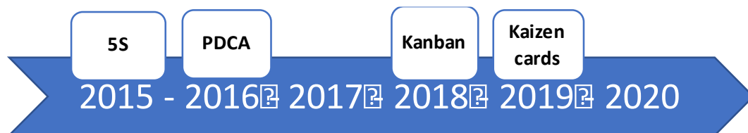
Figure 2. Lean tools implementation sequence in the studied company.

Figure 2 shows a visualisation of the implementation of particular Lean tools in the investigated manufacturing company. At the beginning, in 2015, the company decided to implement the 5S method to improve safety and provide proper organisation at the workplace. 5S allows achievement of higher efficiency by faster execution of orders, quality improvements and most importantly – less likelihood of accidents. After a positive impact on daily work was achieved, the decision about PDCA implementation was made. It was responsible for timely problem solving and elimination of the lack of standardisation in terms of action-taken and results achieved. The company wanted to build a continuous improvement culture to manage problems in an effective way. Seeing the business benefits of previous development projects in 2018, the organisation decided on a Kanban implementation in response to waste (material losses for production orders). This decision was based on deep analysis of the potential benefits. Before implementation, managers elaborated the success factors for this initiative. Finally, after four years of developing a continuous improvement approach in the company, they decided on one. It was a Kaizen technique – a suggestion system, referred to as ‘Kaizen cards’. Employees were allowed to report suggestions and ideas that could improve safety, quality and efficiency in the organisation.