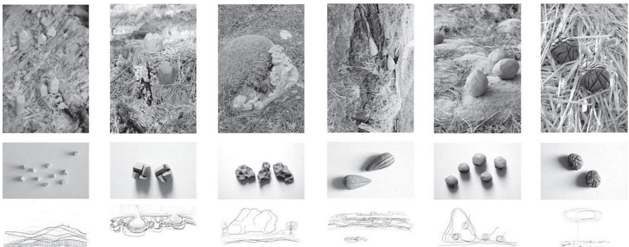
Fig. 5. Selected sketches and photos from the placement of sculptures in the Kashubian natural realities, exhibition entitled "Kaszubskie zamieszkiwanie. Studium" Gdański Archipelag Kultury PLAMA, Gdańsk-Zaspa (author: A. Kurkowska)

The most obvious archetypes concerning the formation of living space that function in culture relate to the refuge.