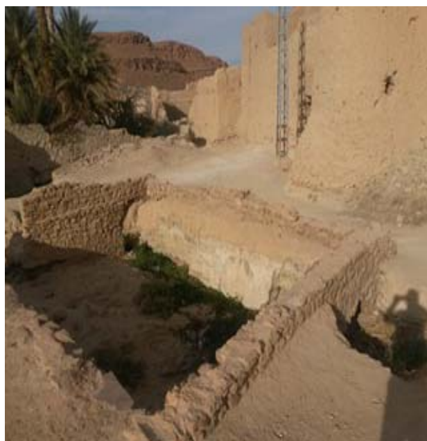
Photo 1. Old pools of water accumulation of ksar and palm grove