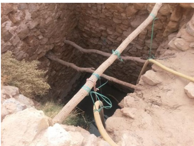
Photo 2. A traditional well in the palm grove of Taghit

In Taghit, there are over 300 traditional wells between 3 and 15 m high and 2 m in diameter, most of which are protected with concrete or stone nozzles (Photo 2). They get the waters of the Wadi Zousfana inferoflow aquifer. Most of them are equipped with motor pumps that contribute to the drying up of the water sources. Generally, traditional wells are private properties; each owner has the freedom to water their fields whenever he wants.