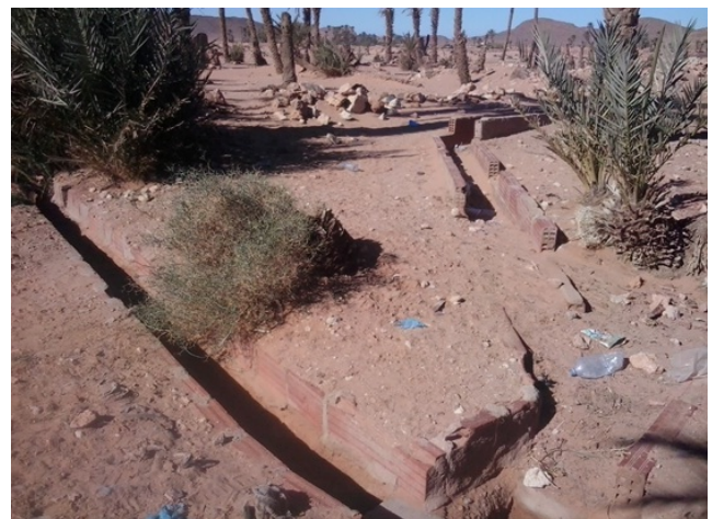
Photo 3. Degradation and silting of irrigation canals in the palm grove of Taghit

The oasis suffering today from several problems, the most important are the lack of water either for the palm grove or for the drinking water supply of the population according to the remarkable depletion of the water tables, as well as the lack of qualified manpower to rehabilitate the foggaras and these channels, degradation of the systems of catchment and sharing of water such as the irrigation canals and the accumulation basins as well as the catchment foggaras (Photo 3), the abandonment of plots because of fragmentation of gardens by inheritance, the aging of palm feet, the immigration of youth to sectors more profitable than agriculture inside the palm grove.