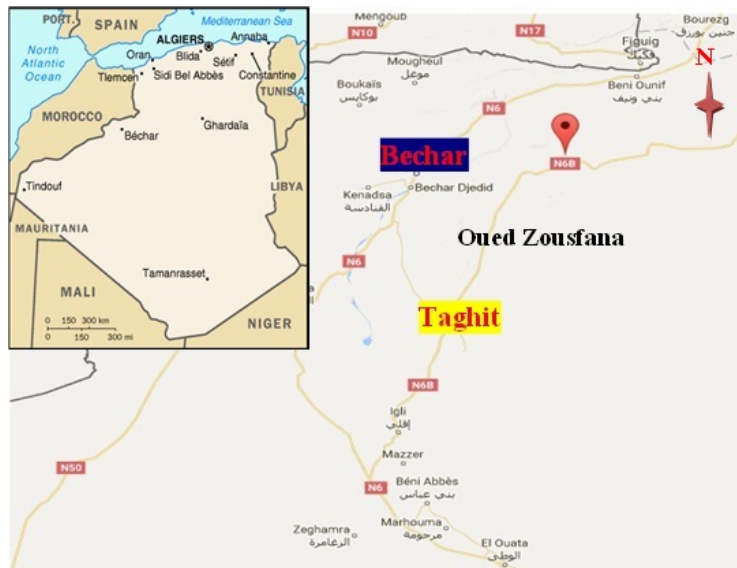
Fig. 1. Location of Taghit

Below the Grand Erg Occidental, the ksar of Taghit is connected with the palm grove by a system of Seguia and underground galleries spring water from the springs towards the gardens of the traditional palm grove (Fig. 2). Today the ksar of Taghit and suffered from several problems: every attempt at restoration failed because of a lack of expertise and poor planning, lack of skilled labour, the drying up of most of the sources that feed the ksar, Pre-dominance of the modern urban fabric at the expense of old ksar and the degradation and weakness of the financial performance of the population.