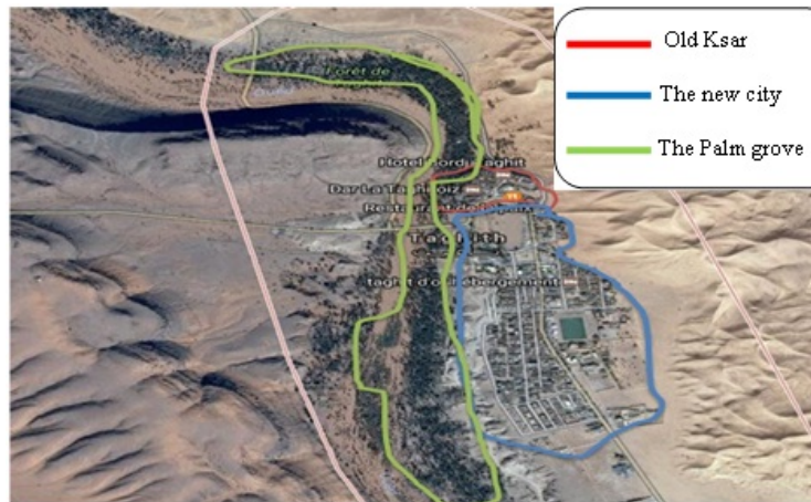
Fig. 2. The Taghit oasis; source: REZZOUG et al. [2016]