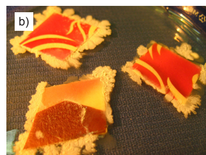
Figure 1. Method of agar flooding. Growth of: a) bacteria on box pad for confectionary, b) board box.