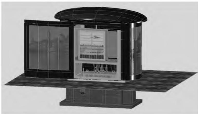
Rys. 2. Arrangement of the BST-P 20/630 station equipment parts

transformer an oil tray containing 100 percent of the oil is assembled at the foundation bottom. The tray is protected against oil leakage to the environment and against humidity. Figure 2 presents arrangement of the station equipment parts inside the housing. Figure 3 shows the way of assembling the MV and LV switchgears.