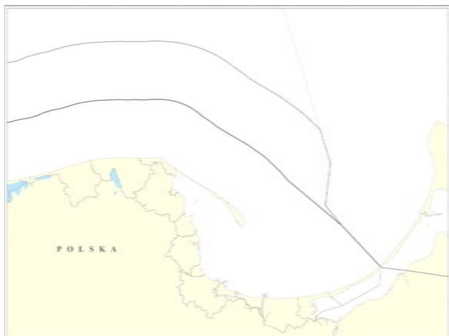
Figure 3. Outer limit of the Polish territorial sea and the outer limit of the contiguous zone – Eastern part