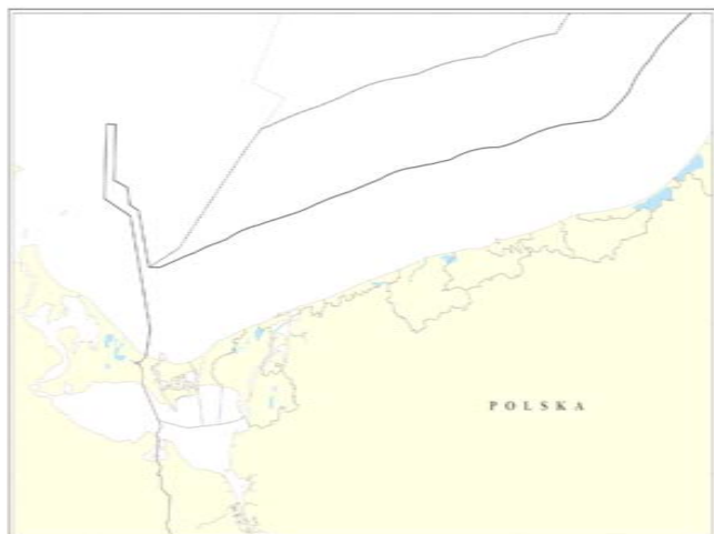
Figure 1. Outer limit of the Polish territorial sea and the outer limit of the contiguous zone – Western part

Republic of Poland entered into force (see three attached charts from the Regulation).