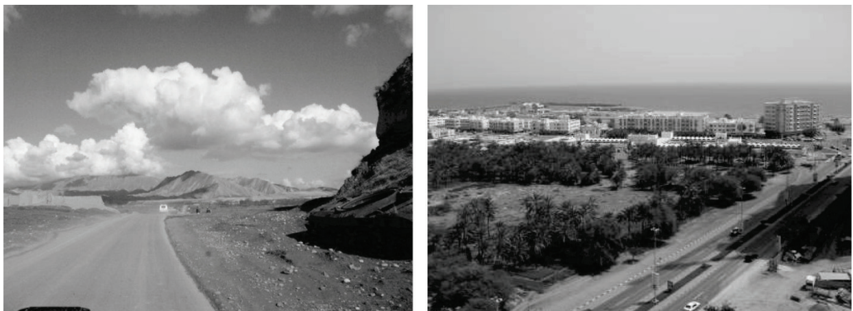
Fig. 7. Road in Afghanistan and Al Fujarah seaport (UAE)

In case of airlift (variant no 4) assuming that there are approx. 500 containers and approx. 300 trucks and two AN-124 per day are at our disposal, whole equipment would be moved back within 40 days. Of course in practice it is not possible firstly