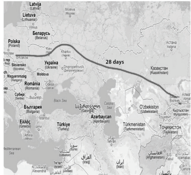
Fig. 2. Minimum transit time of road/rail transport: (left) from Afghanistan to Uzbekistan, (right) from Uzbekistan to Poland

port was used by Polish Armed Forces during the deployment phase to Afghanistan ISAF operation. In order to increase security there is an option to provide intermodal transport (air-sea) airlifted cargo from Afghanistan (e.g. Baghram) to United Arab Emirates (e.g. Dubai, Al Fujarah) and then sealifted back to Poland or other countries.