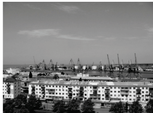
Fig. 5. Rail and road infrastructure in Kazakhstan.