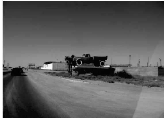
Fig. 3. Rail and road infrastructure in Kazakhstan.

The second variant – the Central corridor is divided into several phases to calculate time of equipment movement (Figure 4). Analysis shows that minimum transit time is 25 days.