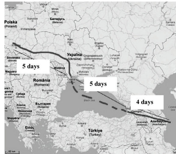
Fig. 4. Minimum transit time of road/rail transport: (left) from Afghanistan to Azerbaijan, (right) from Azerbaijan to Poland Personal elaboration