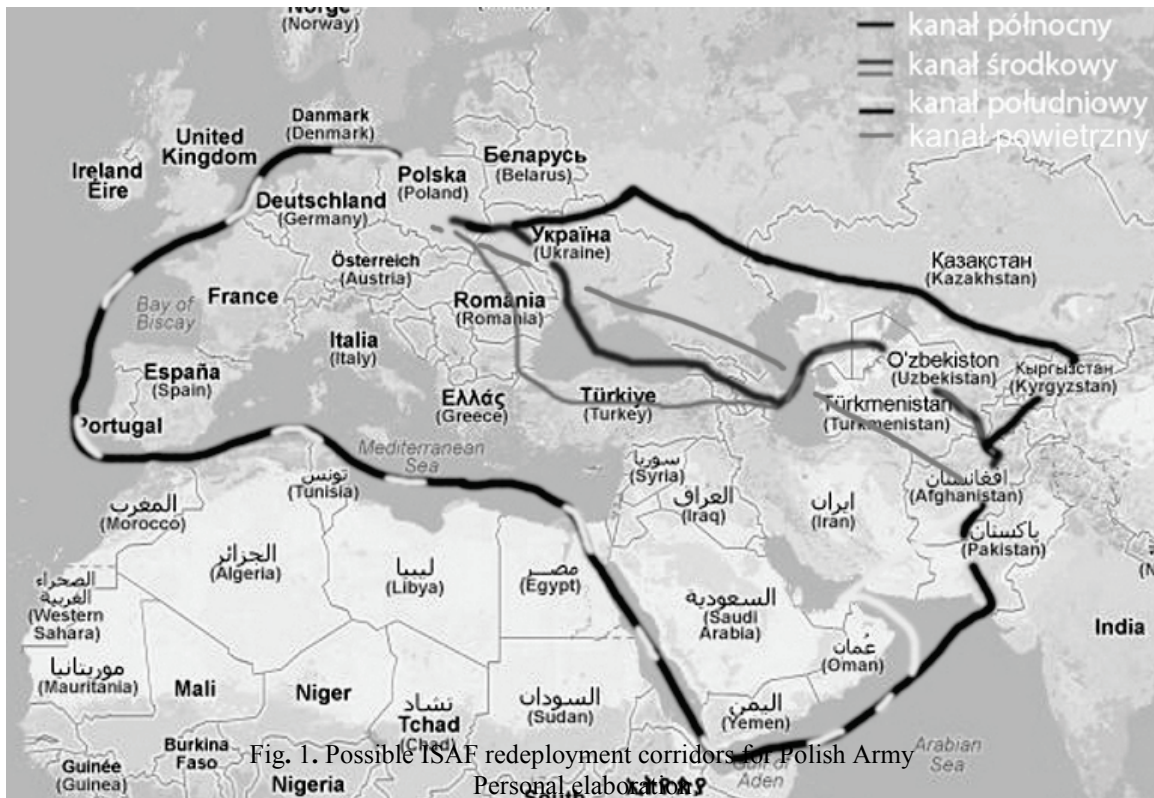
Fig. 1. Possible ISAF redeployment corridors for Polish Army

The Central corridor was recently modified after the Turkmenistan refusal to allow military