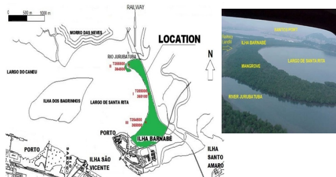
Figure 2. The location of the mangrove bank studied. In detail, aerial photo with at first plan, River Jurubatuba, and after, Largo de Santa Rita.

In an agreement between the Hydraulic Laboratory and CODESP (Port of Santos Authority) it was decided to define a characteristic stretch of the preserved mangrove of Largo de Santa Rita (Ilha Barnabé) for a previous qualitative biological survey to better understand the characteristics of the habitat (Figure 2). Although the Santos Estuary is a studied region, there was no prior knowledge of the mangrove preservation status in this area of Ilha Barnabé. The small bay has depths less than 3 m, and the land stretch has well-defined limits of port structures, railways, and highways, making it possible to estimate the potential loss of mangrove areas in the coming decades, due to mean sea level rise [3]. Observe in the figure the landfill of the railroad crossing the mangrove of Ilha Barnabé. The railroad separated the mangrove plain in the middle of the seventies, thus more than forty years ago.