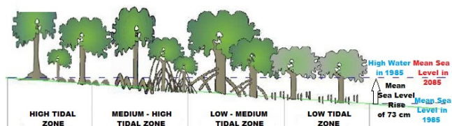
Figure 5. Typical mangrove plain and the mean sea level rise expected in 1985.