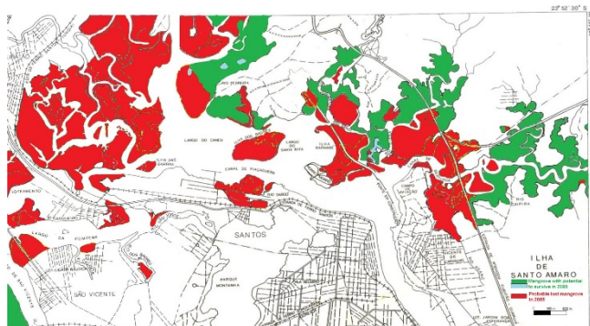
Figure 6. Expectancy mapping of the mangrove in 2085.