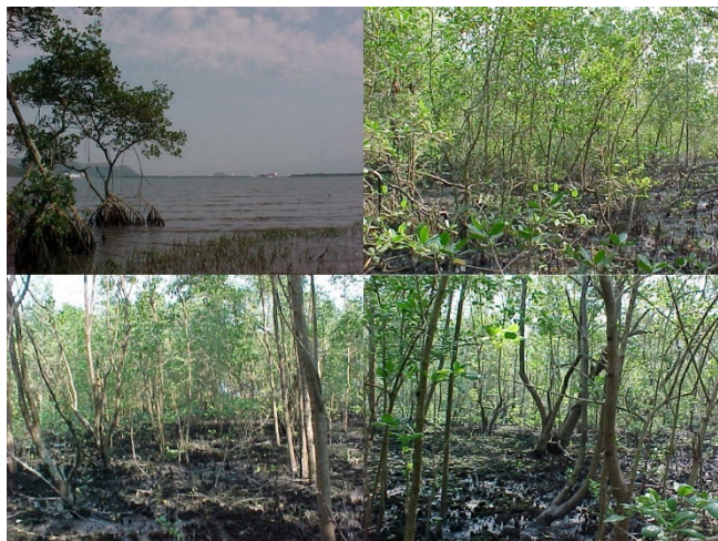
Figure 4. Photo of the mangrove aspects in the three plots during the survey.