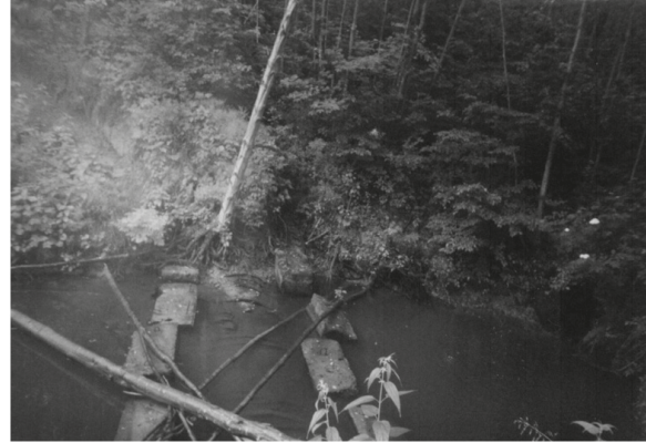
Figure 4. Product pipeline under the Berezhnytsya river stream-way