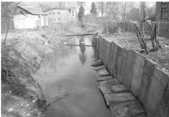
Figure 5. Disturbance of limits of bank-line protective zone, Morshyn city

Carrying its water farther, the Berezhnysya river flows through unpopulated territories from Dovge village to Lotatnyky village, for this reason the anthropogenic impact is subtle, though river runoff is being regulated by ponds. Natural biocenoses somehow degraded under the human activity. The above data allowed to assess the condition of this area as “good”.