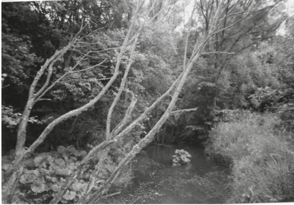
Figure 3. Aquatic and flood-plain vegetation at the first study segment along the Berezhnytsya river