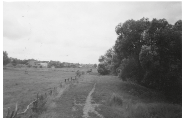
Figure 7. Degraded flood-plain vegetation, the Berezhytsya river (Yosypovychi village)

Next two segments are very similar to each other and for this reason we consider them as one. These segments stretch from Yosypovychi village to Berezhytsya village. Their condition is assessed as “satisfactory” because most of the flood-plain is covered with damaged or degraded agrobiocenoses, and the livestock permanently grazes here (Figure 7). The aquatic vegetation is very poor. The limits and regimen of bank-line protective zone is disturbed.