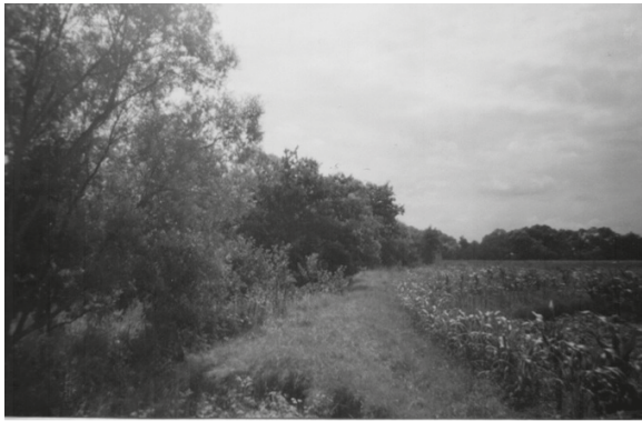
Figure 6. Disturbance of bank-line protective zone limits, Dashava urban settlement