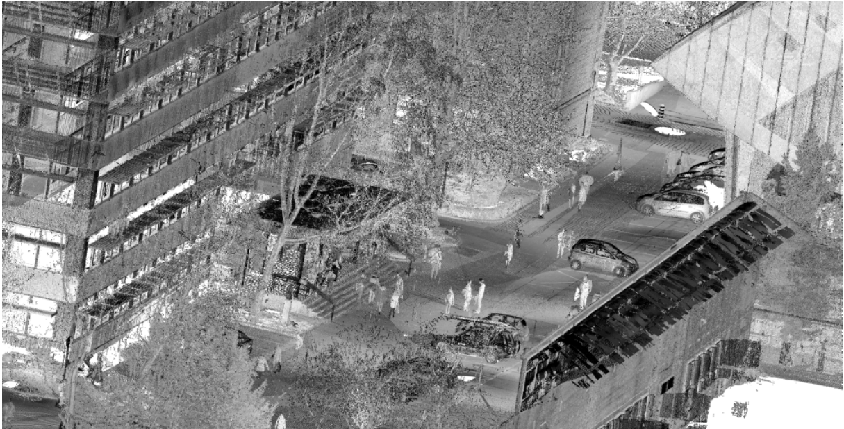
a) Detail of the laser scanned point cloud of the BME campus

near to Budapest, where the road is in rural environment (no neighbouring objects, practically no elevation information). The test road has many lanes with relatively new lane markings, which are excellent for creating a test lane model.