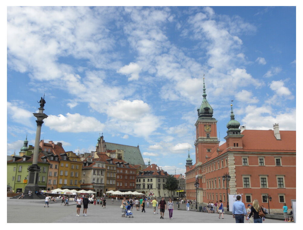
Fig. 2 Historic Centre of Warsaw

The evolution of the Convention greatly influenced policies globally, even new legal instruments! This is the case for example of the European Landscape Convention <sup>7</sup> after the adoption of cultural landscape categories in 1992 or the UNESCO Recommendation on the Historic Urban Landscape <sup>8</sup>, which emerged from discussions in the World Heritage Committee. In the following I focus on a few selected policies which are much relevant today, when we celebrate the 50th anniversary and look forward to working on the protection of heritage for the next decades.