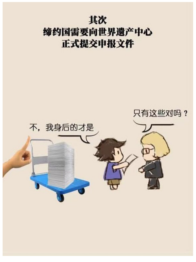
Fig. 1 Chinese cartoon on the submission of nominations to the Director of the UNESCO World Heritage Centre, © CHCC/Yunpei Gu 2021

It is clear that a number of provisions were not implemented (early) enough, including the obligation for (updating) Tentative Lists, prepare comparative analysis at early stages, collaboration including transnational/transboundary sites, and the application of other policies such as the Global Strategy of 1994 in view of the diversity of topics, themes and types of sites and especially the Harmonisation of Tentative Lists within (sub)regions).