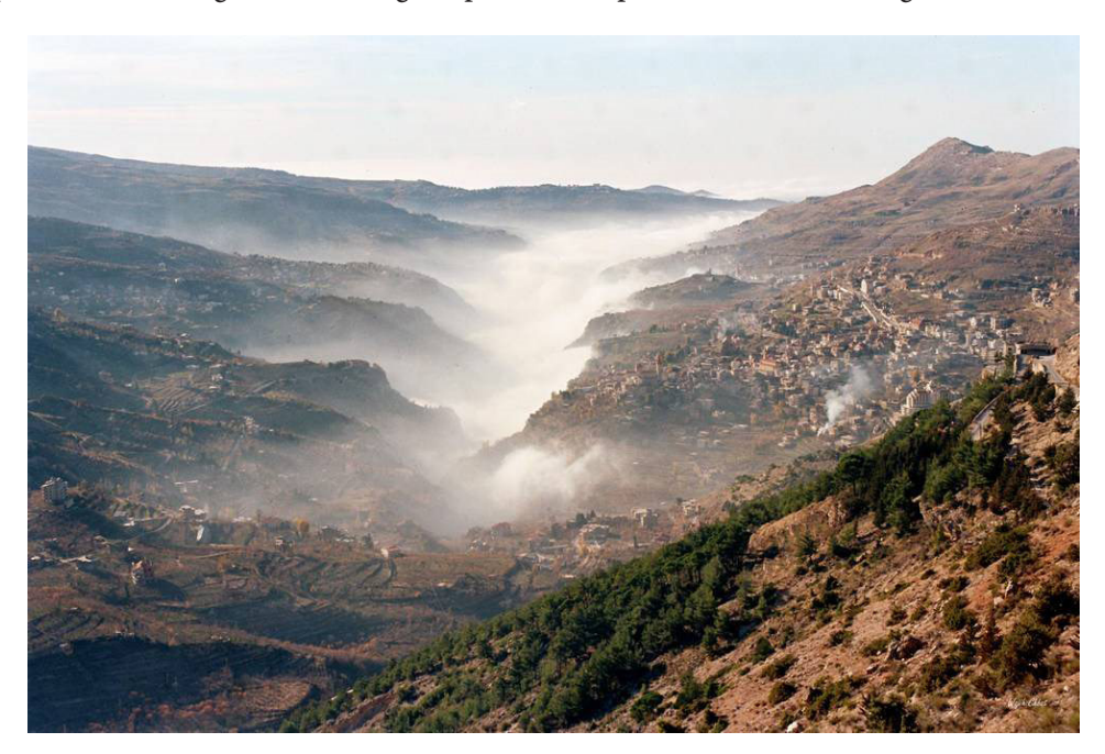
Fig. 4 Quadisha Valley (Lebanon)

Already as early as 2005 the Committee discussed a policy on climate change which was adopted in 2007. The impacts of Climate Change on World Heritage properties are critical, with increasing temperatures, sea level rise, melting of ice cover, intensity and frequency of extreme events (fires, floods, droughts), changes in human land-use and agricultural heritage seriously affect European heritage and heritage worldwide. The debates around World Heritage influenced other discussions, including through the ICOMOS and IUCN (Outlook) work in this regard. It was deeply disappointing that the updated policy presented to and endorsed by the World Heritage Committee in July 2021, was not adopted at the General Assembly of States Parties in November 2021. It can be considered as a lost opportunities and a delay of at least 2 years in a global crisis. On the other hand, States Parties and site managers can already advance on the ground to better prepare for increasing climate change impacts to the precious World Heritage sites.