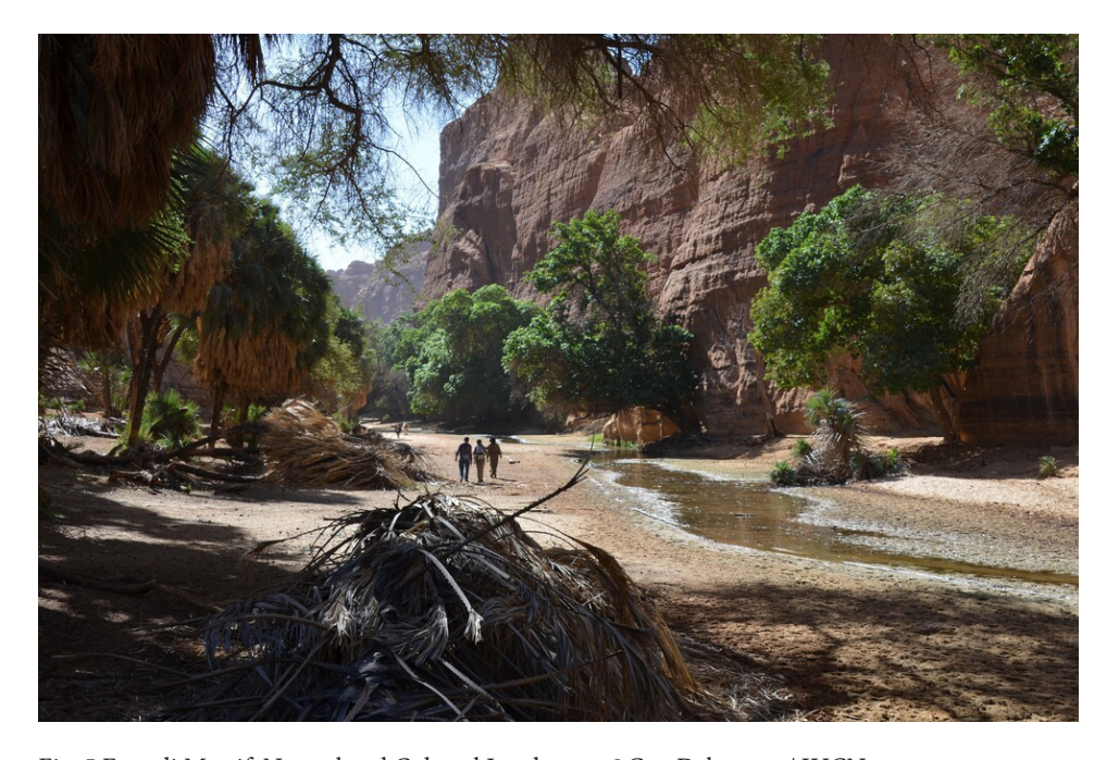
Fig. 5 Ennedi Massif: Natural and Cultural Landscape

Closely related to this is the World Heritage and Sustainable Development Policy, which was adopted in 2015 in parallel and aligned with the 2030 Agenda of the UN. On 19 November 2015 the 20th General Assembly of the States Parties to the World Heritage Convention adopted this Policy on the integration of a sustainable development perspective into the processes of the World Heritage Convention. The overall goal of the policy is to assist States Parties, practitioners, institutions, communities and networks, through appropriate guidance, to harness the potential of World Heritage properties and heritage in general, to contribute to sustainable development and therefore increase the effectiveness and relevance of the Convention whilst respecting and protecting the Outstanding Universal value of World Heritage properties. Its adoption represents a significant shift in the implementation of the Convention and an important step in its history. To operationalize the Policy for the integration of a sustainable development perspective into the processes of the World Heritage Convention, a workshop elaborated an action plan, as an aspirational set of activities for the implementation of the policy, aiming to engage all the stakeholders of the Convention, at international, regional, and local levels. We are looking forward now to hear further from best practice from World Heritage sites with innovation and youth engagement<sup>12</sup>!