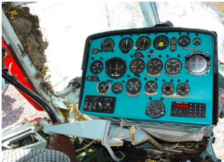
Fig. 2. View of a helicopter instrument board with recorded positions of indicators and switches

As for the elements of the aircraft, both the appearance of the elements and their spatial location in the area should be examined. When there are doubts about the name of a given element, its function and completeness, members of the PKBWL (if present at the aviation accident scene) may be asked for help, or the identified element may remain without a name, but with its appearance recorded.