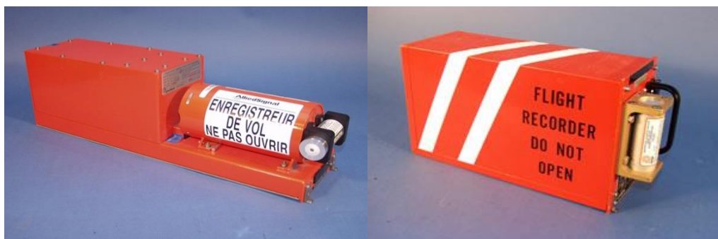
Fig. 4. Overview of different flight data recorders

Other devices that are not typical recorders, such as GPS devices, handheld video cameras, mobile phones, laptops, industrial video cameras and photo cameras, can also provide information about the flight course.