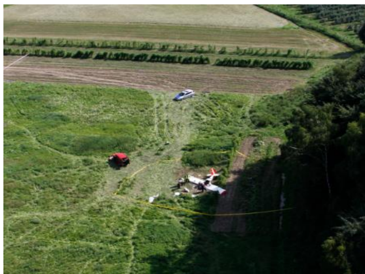
Fig. 1. Overview of an accident scene recorded by aircraft