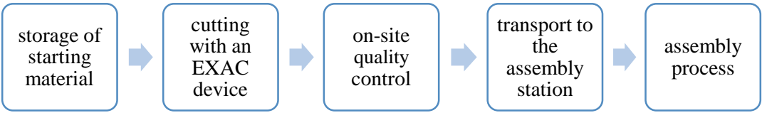
Figure 2. Diagram of the pressure vessel production process after changes.