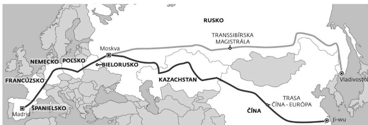
Fig. 3. Map of the transport Yiwu – Madrid Rys. 3. Mapa transportu Yiwu – Madryt

On November 18, 2014 another link of combined transport was opened, this time from the Chinese city of Yiwu to Madrid in Spain. This is a further confirmation of the importance of the rail link of Asia with Europe. Train route passes through seven countries. In Central Asia, it is passing through the Chinese region of Xinjiang and then through Kazakhstan, Russia, Belarus, Poland, Germany, France to the target destination in the Spanish Abroñigal terminal near Madrid. The total length of this route is 13 053 km. An interesting feature of this link is that it undergoes two gauge changes and the goods must therefore reloaded twice. The first change is a change from broad-gauge to standard gauge and then reloading from standard to broad-gauge (Spanish) lines. The whole transport link is shown in Fig. 3.