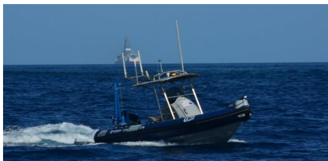
Figure 3. UTEK unmanned boat tested at PLOCAN test-site

A multidisciplinary group of Spanish research centers, companies and public agencies, under the coordination of DGMM (General Directorate of Marine Merchant) are joining forces since late 2020 in order to setup a working group on autonomous maritime navigation. Its main goal is to setup the right national framework to develop and operate USV and autonomous ships that currently are under development [56, 78]. PLOCAN is one of the active partners providing both test-site capabilities and the ownership of the first autonomous boat flagged in Spain [24].