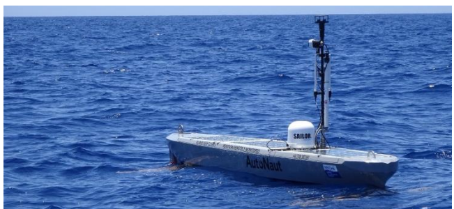
Figure 2. AutoNaut ASV trials at PLOCAN test-site facilities

All of them are fully or partially powered by endless ocean-energy sources. In parallel, half-way to autonomous ship concept, developments such SeaKIT [73]; Ocean Infinity [59] have also been released for specific seabed-mapping and survey-services in industry applications at ocean-basin level worldwide. These developments, many of them already commercial, demonstrated that specialty USV could withstand the harsh ocean environment for extended periods and their software and systems were reliable enough for extended voyages and missions.