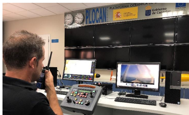
Figure 4. USV - Shore Control Centre (SCC) at PLOCAN facilities

One of the biggest challenges in developing the technology for MASS is to demonstrate that unmanned systems are at least as safe as a manned ship system and to provide the Shore Control Centre (SCC) with adequate situation awareness. In case of emergency situations such as stranding or evasive manoeuvring, the ship systems should be remotely monitored and controlled by the operators of the SCC receiving crucial information via satellite at short time intervals (Figure 4). The SCC should also have a smart alarm system and the ability to switch to the manual control mode in case of doubt on the autonomous system [38, 63, 68].