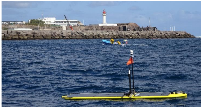
Figure 1. Wave Glider ASV starting a mission conducted by PLOCAN

The initial reference on the path to autonomous ships is technical. The core technologies that enable unmanned vessels have come about largely due to developments in other fields [8, 15, 22, 23]. Improved USV capabilities allow to undertake missions both in coastal and open-ocean areas for long periods of time due to a more efficient power and propulsion systems based in some cases on renewable energy sources (solar, wind, waves), Fig. 1. State-of-the-art broadband telemetry systems enable remote real-time operation and decision-making by the operator. In parallel with the mechanical and electronic system architecture improvements for USVs, software advanced rapidly as well, with special focus on autonomous navigation methods and techniques in compliance and contribution to ocean digitalization and e-navigation framework initiatives.