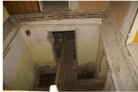
Fig. 3. Removing a part of the old ceiling.