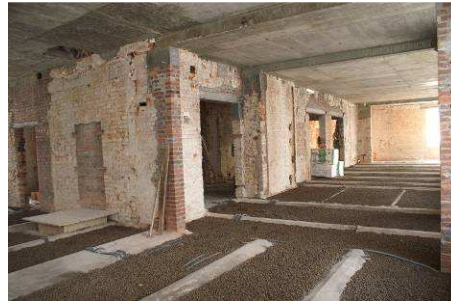
Fig. 5. Construction works on floors.