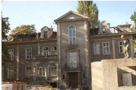
Fig. 2. Building during the taking apart of roof trusses.