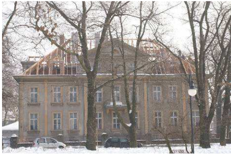
Fig. 4. Replacing the roof truss system