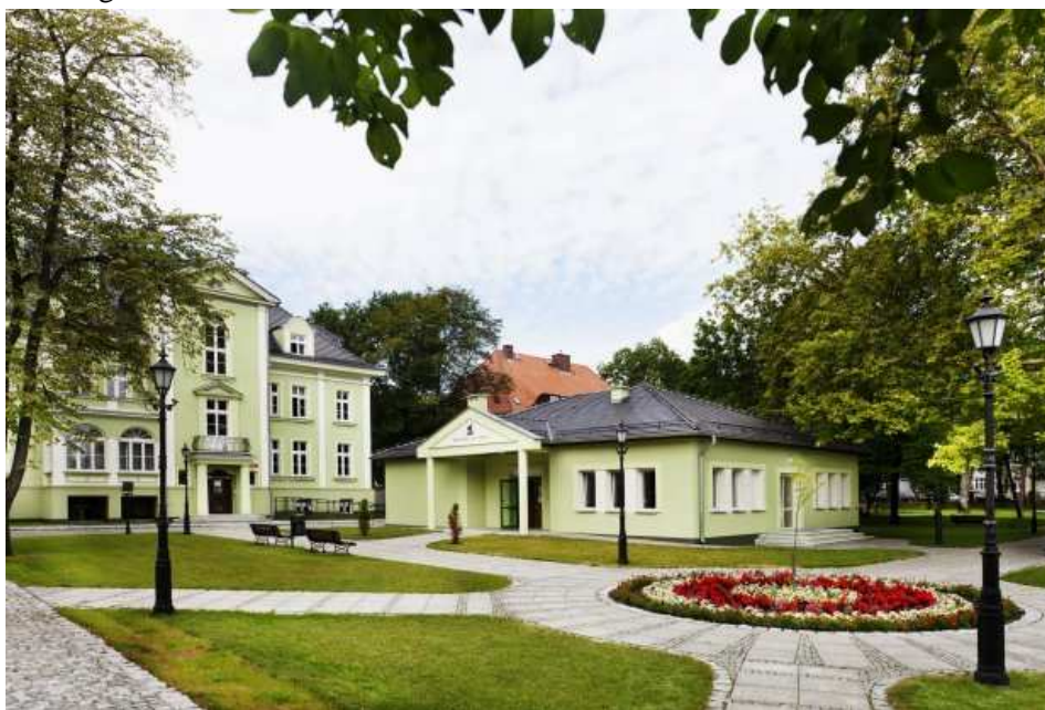
Fig. 6. New headquarters of the City Public Library.

The new MBP headquarters on Bankowa Street fulfill all qualities, esthetic as well as functional. The building, which had been falling into ruins during the time it functioned as doctors' clinics, was given a "second life". The elevation of the building was beautifully restored providing access to the handicapped and inside rooms were adapted to serve library functions. The library is equipped with modern electronic devices, which facilitate providing fast service to readers, ongoing registration of volumes and using electronic library cards. Halls for organizing book readings, meetings with authors and other cultural events are present in the building. The entire building is surrounded by a green park referred to as the Art Garden, where one can find, among others, a fountain, pergola, mini amphitheater, area for playing chess in the open air and parking places. As a result of such activities, a representative building which has been the home of the MBP since 2011 was created. The previous headquarters had been located in a building near the corner of Parafialna and Szkolna Streets. Despite applying modern devices and technologies, the MBP building has maintained its historic nature.