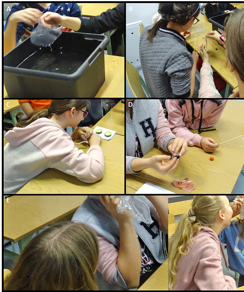
Fig. 1. Students conducting experiments during a workshop at a science festival (Opole, Poland; January 2020). A - Testing propulsion in water. Students waved their hands, three times in a row, in a large plastic bowl filled with water; firstly, with widespread fingers; secondly, with straight, joined fingers and, thirdly, with a plastic, hand-sized fin. They tried to compare the effectiveness of such moves, decide which is best and answer the question of what kind of limb yields the highest propulsion in water; B - Testing neutral buoyancy. Students observed a thin stick floating on water, like bones of terrestrial animals. By using the given props, they tried to make the stick sink (to achieve neutral buoyancy, as in the body of an aquatic animal). It is quite easy to have the stick sink using plasticine, or gluing stones, but an explanation is needed. Following the experiment, different methods of gaining neutral buoyancy were revealed: 1) pachyostosis (additional layers of bone which cause bone thickening), as seen in, for instance, manatees and plesiosaurs, 2) osteosclerosis (bone gaining a higher density through mineral deposition in inner bone cavities), as seen in, for example, turtles and extinct sloths, 3) swallowing rocks (gastroliths), as seen in, for instance, alligators, birds and ichthyosaurs; C - Testing salt acting on the organism. Students took a piece of cucumber with skin and one without, and some amount of salt on both pieces and observed. After some time, when the piece not protected by skin started to dehydrate, students had to answer how salt in water could be harmful to aquatic animals. Subsequently, several examples of dealing with excess salt could be demonstrated (for example, "sneezing" iguanas, "crying turtles"); D - Testing preserving body heat. To compare how terrestrial and aquatic environments are linked with losing heat, students produced three plasticine spheres. One (terrestrial environment) stayed on the table and two went into the aquatic setting (cold water); one without any protection and the other wrapped in fat (bacon plaster). After a few minutes students took out the spheres and compared their temperature. Finally, they answered the question of which of the two was warmest and why there was a difference between the spheres taken from the water. Ways to retain heat in water can be explained with the example of a walrus; E - Testing the senses: hearing and sight. Students put a long prop (stick, straw or spoon) in water (while part remains above water level) and observed the breakdown of the prop. Students also filled a large plastic bag with water, then put it to their ear and tried to understand what fellow students standing next to them were saying. After these experiments, students concluded that hearing and sight in water differed from hearing and sight on land, and tried to explain why that was. Adaptations of different animals to effective sight and hearing in water were given as examples (dolphins and echolocation, large-eyed ichthyosaurs and seals with a tapetum lucidum ).