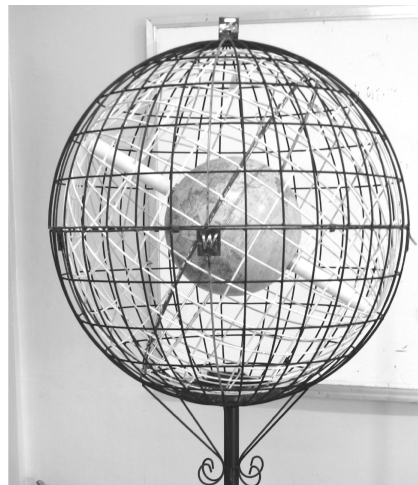
Fig. 4. Combined Blue and White Celestial Spheres