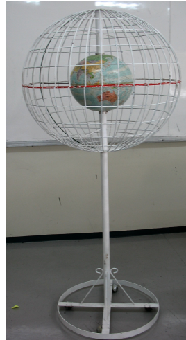
Fig. 3. White Celestial Sphere with Globe at its Center