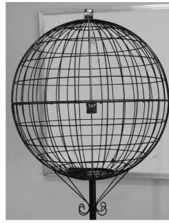
Fig. 2. Blue Celestial Sphere

There are two major parts of the instructional tool: the blue Celestial Sphere (Figure 2) and the white Celestial Sphere enclosing a globe in its center (Figure 3). Using the blue sphere, topics about the Horizon system of coordinates such as Zenith, Nadir, Altitude, Zenith distance, Azimuth, Point on the horizon, Prime vertical circle, Principal vertical circle, Vertical circles, and Altitude circle or parallel of altitude are easily conveyed to the students. On the other hand, with the use of the white sphere, Time Diagram, Celestial Equator system of coordinates, and Terrestrial System of coordinates are better communicated with the students compared with just using one-dimensional drawings of spheres. Lessons on Time Diagram include Hour circles, LHA, GHA, SHA, RA, Meridian angle, Meridian passage, and Longitude); on Celestial Equator system of coordinates involve Hour circle, GHA, LHA, Meridian angle, Declination, Polar distance, Diurnal circle or parallel of declination, Nocturnal arc, Celestial poles and Celestial equator, and; on Terrestrial System of coordinates are Terrestrial poles, Equator, Meridians, Greenwich meridian, Geographical position of the body, and the equivalence of the its components to the celestial system’s components. Eventually, the blue and white spheres are combined to illustrate concepts of Meridian passage, Circumpolar bodies, Polar distance, Zenith distance, Co-latitude, and finally the composition of the Navigational Triangle. See Figure 4.