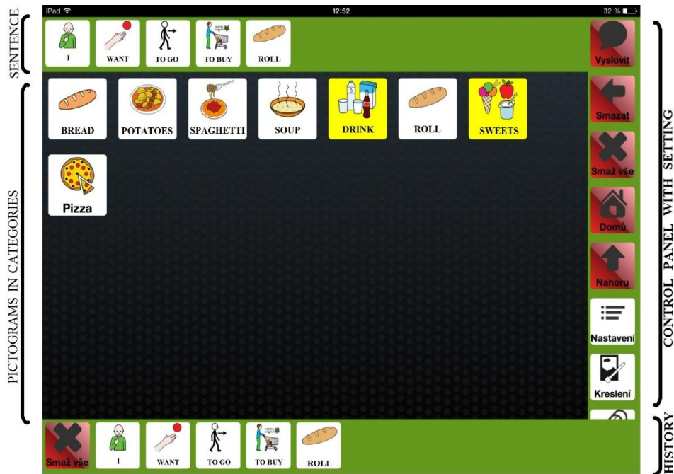
Fig. 2. Easy-Talk application desktop is accessible in several languages including Czech – in comparison with other AAC apps, this desktop is also customizable by different visual styles and its control panel contains more functionality for AAC expression (own study)

In recent years the usage of AAC apps on tablet computers have proven significant results when working with the intellectually disabled, see (Bradshaw, 2013; Fiala & Koci, 2015).