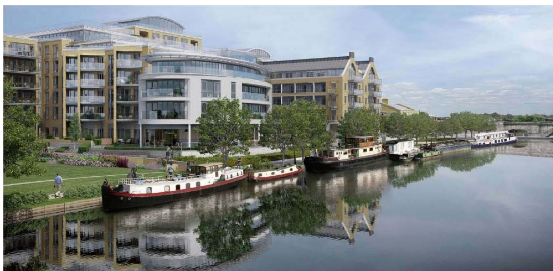
Figure 2. Narrowboats moored next to Kew Bridge in London [1]

The State of the Surroundings Scenarios (SSS) evaluate the impact strength of individual processes (factors) on the research subject. The knowledge of the scenario creators and consultants are the basis of the evaluations.