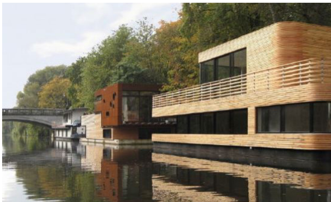
Figure 3. Floating House in Eibekkanaal, Hamurg, Germany [17]