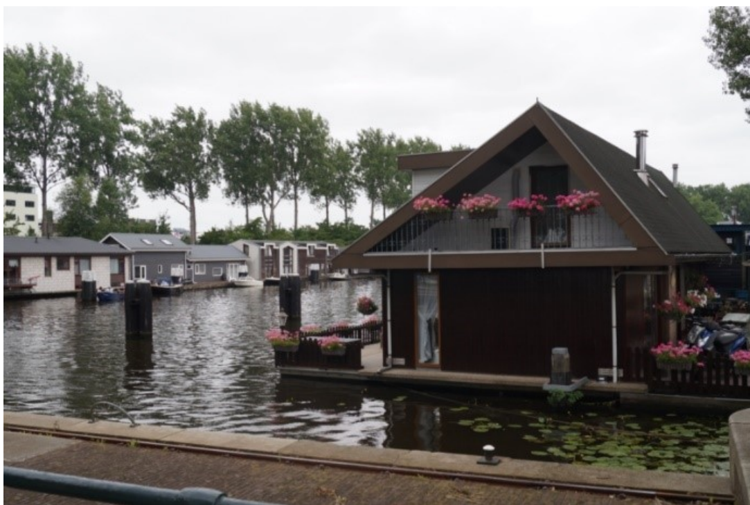
Figure 1. Estate of floating homes in Amsterdam [16]