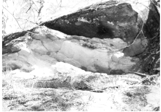
Fig. 6. Feldspathic sandstones in the Rock under a pine tree.

Ryc. 5. Melafiry w nieczynnym kamieniołomie koło Rudna.