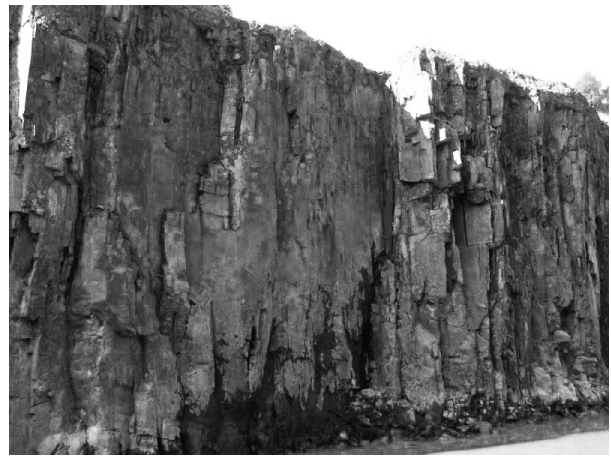
Fig. 4. Diabase wall in Bear Mountain. Ryc. 4. Ściana diabazu w kamieniołomie Niedźwiedzia Góra.

the size of a hazelnut, and violet coloured crystals remains quartz (amethyst), which fill small vacuums.