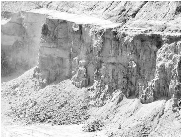
Fig. 3. Porphyry wall in Zalas Quarry. Ryc. 3. Ściana porfirów w kamieniołomie na terenie Zalasia.