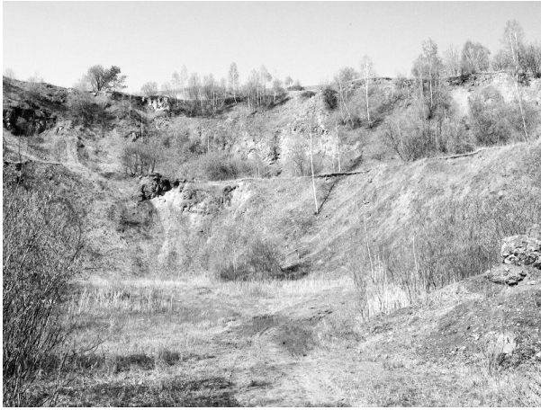
Fig. 5. Melaphyres in old quarry near Rudno.

Ryc. 5. Melafiry w nieczynnym kamieniołomie koło Rudna.