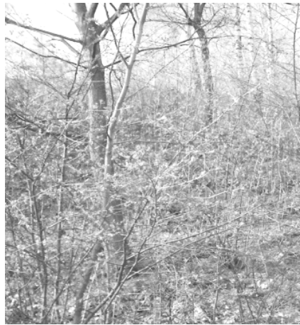
Fig. 7. A fragment of the mine dumps Adam in Tenczynek.

Ryc. 6. Piaskowce skaleniowe w skałce pod sosną.