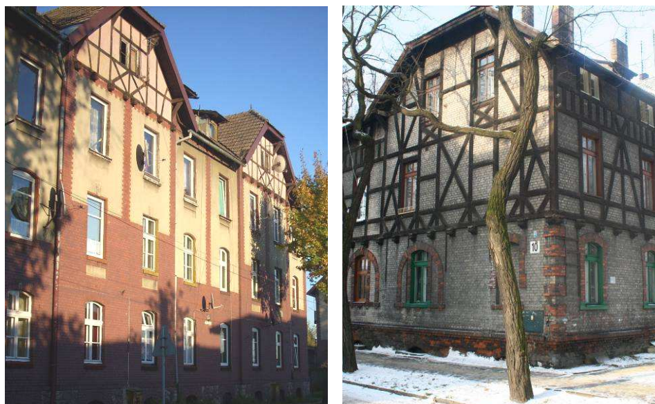
Fig. 2. Residential buildings in the railwaymen settlement in Pyskowice (left) and Zandka in Zabrze (right)

These objects were created during the periods of different, from today's, regulations on thermal insulation or lack of them. Their current state of the