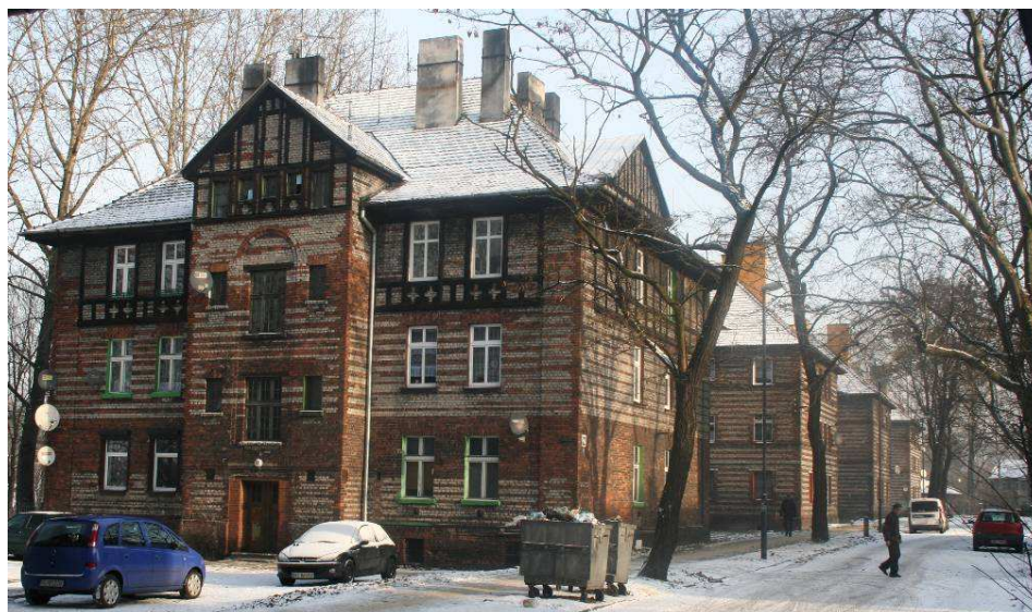
Fig. 1. Residential buildings in the settlement of Zandka in Zabrze