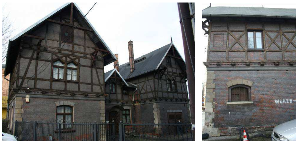
Fig. 3. Building of State Music School in Gliwice.

thermal protection varies greatly, especially since the barriers of the same form in detached houses are already extremely rare.