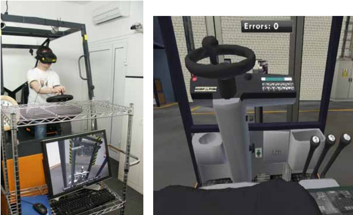
Figure 1. Forklift truck VE simulator used in experiments (left). VE simulator cockpit in a virtual environment (right). Notes. Speed—speed of the forklift truck virtual environment (VE) simulator moving in a VE (km/h); height—height of fork position (m) (the fork supports the load in the VE simulator); tilt—inclination of the mast of the simulated forklift truck ( ^{\circ} ); errors—number of errors (e.g., collision between the simulated forklift truck and elements of infrastructure) made by the operator during driving, recorded by the VE simulator acquisition system.