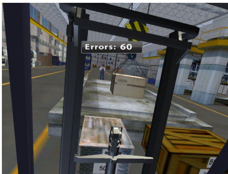
Figure 2. Picking the load in the virtual environment to carry it along the route determined in the virtual environment to its destination.

points with known geometric coordinates. No significant changes in time were recorded.