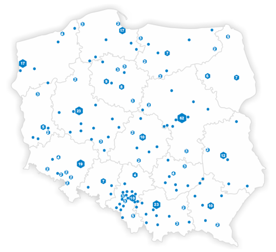
Fig. 1. Innovation and entrepreneurship centers in Poland in 2017 (leading institutions)

For the development of Polish biotechnology spin-offs and start-ups in the conditions of global competition, the overall innovation of the economy, processes of developing a knowledge-based economy and conditions for the commercialization of scientific research in Poland are important. Poland scored 68.16 points out of 100 on the 2018 Global Competitiveness Report published by the World Economic Forum. Competitiveness Index in Poland averaged 15.02 Points from 2007 until 2018, reaching an all-time high of 68.16 points in 2018 and a record low of 4.28 Points in 2008. The value obtained in the Innovation pillar assessing the environment conducive to innovative activity places Poland in the 37<sup>th</sup> position on the 140 countries studied [27].