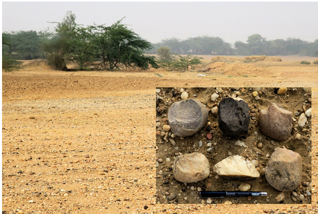
Fig. 5. Pleistocene-age fluvial beds with a wind-sorted sandy-gravelly pavement at Bhojka. Concentrations of Palaeolithic artefacts made on selected clasts of the exposed alluvia point to a sequenced early human occupation of the Thar Desert plain as indicated by a formal (technological) diversity of the lithic industries

forming a chain of barchans, a major of its kind in the Thar Desert, is located ca. 45 km to the west of Jaisalmer. In 1978, Government of Rajasthan initiated a programme of active dune stabilisation of a part of the longitudinal dune field with a technical expertise of the CAZRI. Successful afforestation of sand dune levee slopes sandy surfaces is well documented at the Shetrawa and Dechu dunes.