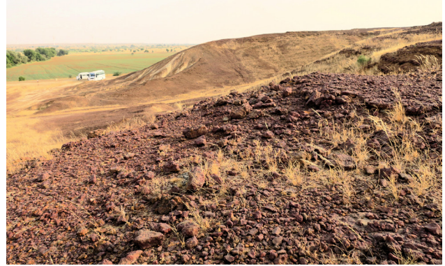
Fig. 4. Escarpments of the Jurassic bedrock-iron per-mineralized sandstone palaeosurface (hamada) at Mokhal (40 km west of Jaisalmer)