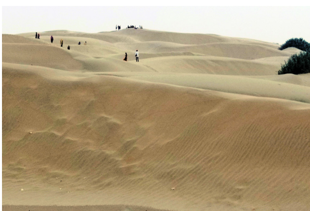
Fig. 6. Linear 20–40 m high sand dunes at Kanoi, SW Thar Desert, with isolated patches of bushy vegetation and wind-deflated depressions exposing an old alluvial gravel pavement

Playas or shallow saline depressions interconnected by a system of perennial palaeochannels are found at Khara Bhagotiya, Lawan and Pokaran with seasonally filled clayey-floor ponds amidst the sandy terrain. Modern hydro-environmental facilities aimed at effective agriculturally-oriented water management included khadins (rainwater storage systems) seen near Baramsar about 30 km from Jaisalmer. Finally, a visit of the sandstone quarry at Balesar underlies the historical tradition of diverse rocky raw material use