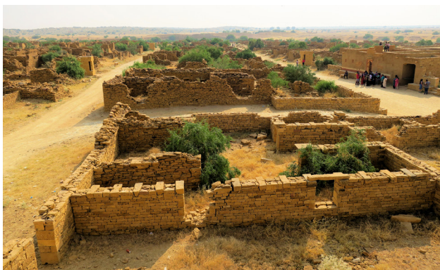
Fig. 3. Ruins of the abandoned early medieval (13 th century) Kuldhara settlement with a unique street grid system with sandstone-built houses, temples, wells and other structures