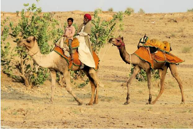
Fig. 7. Nomadic camel herders in the Kanoi sand dune area. Sparse vegetation partly fixing mobilize aeolian deposits in places wind-deflated to the fragmented sandstone bedrock

experimental field studies of the CAZRI, including simulations of fluvial riverine system behaviour after floods and slope wash of sediments during the monsoonal rains (Moharana and Kar 2010). Other landscape ecology issues include geomorphic mapping and landforms analysis in the Thar Desert area in relation to intensified land use and environmental degradation (SAC, 2007, Moharana 2012, Moharana et al. 2013, Raja et al. 2016, Varghese and Singh Naveen 2016). Extensive pastoralism still represents the principal rural economy (Fig. 7).