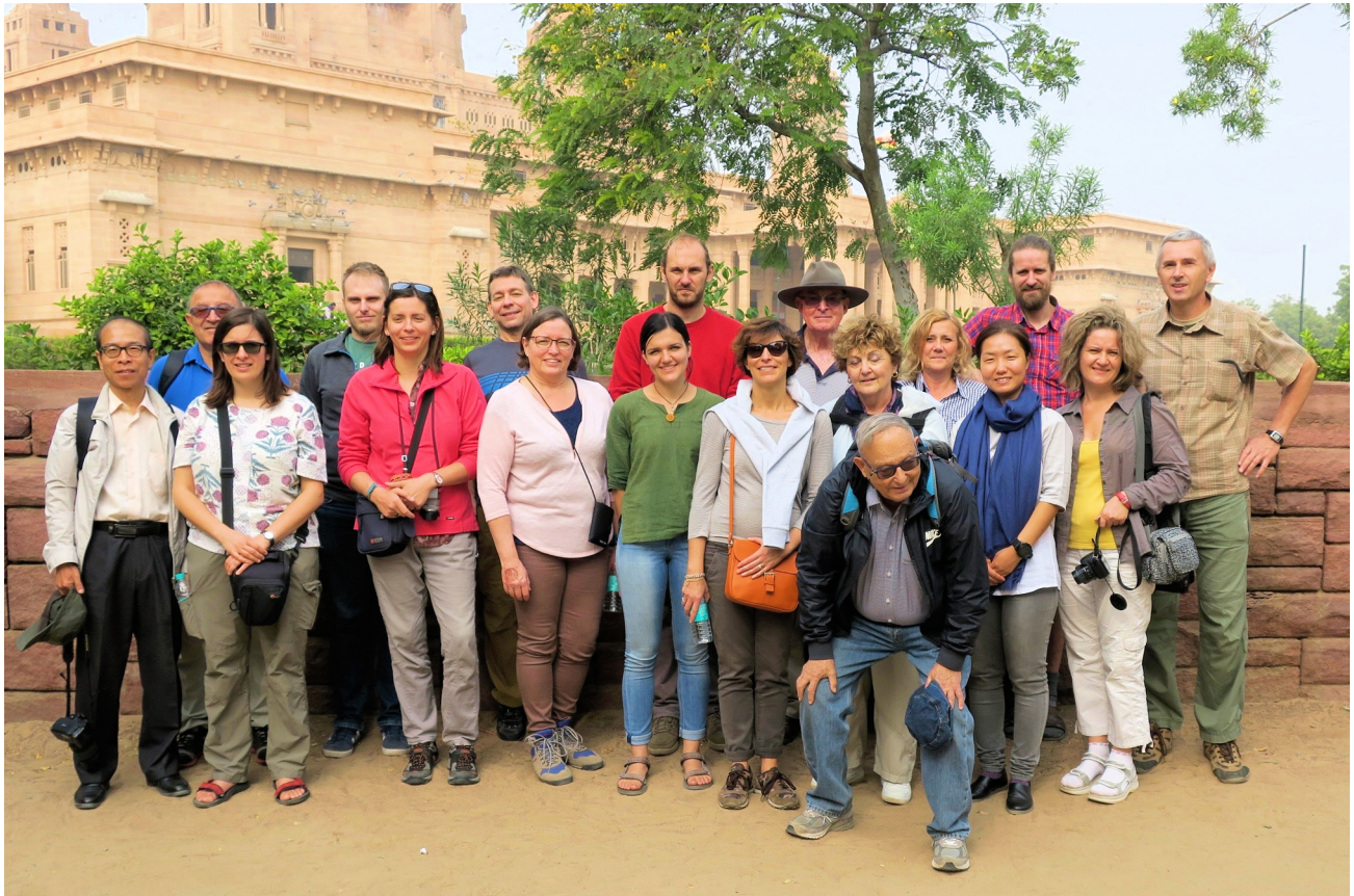
Fig. 2. Participants of the Thar Desert geomorphology field trip in front of the Umaid Bhawan Palace, Jodhpur

sand dune stabilisation in the Thar Desert area and protection of agricultural plantations against progressing desertification of the plain. At present, the CAZRI has five Regional Research Stations and three agricultural technology research centres focusing on cultivation of drought-resistant alimentary and industrial plants. Furthermore, the institute manages five experimental field sectors monitoring the stability of the regional vegetation cover and actual feedback of ongoing climate change. The CAZRI, as the main governmental organization of its kind in India, carries out assessment, monitoring and management of natural resources of the West Indian arid zone in respect to the climate- and human-induced environmental shifts affecting the quality of life of the local peoples. Finally, its major strategic aim is implementation of modern approaches and innovative techniques enhancing productivity of the Thar Desert farmlands in view to the steadily rising local demography. The research institution has developed several need-based and cost-effective technologies aimed at establishment of countryside-protective plantations, wind erosion control, sand dune stabilisation, artificial watershed and water retention reservoir establishment, wasteland mitigation, desert land farming systems and some other alternate land use strategies reflecting the regional natural conditions and socio-economic needs.