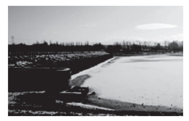
Fig. 2 A water supply reservoir designed for the supply of industrial water