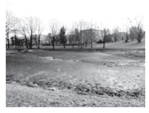
Fig. 3 A dry reservoir intended for area fire protection Rys. 3 Suchy zbiornik przeznaczony do ochrony przeciwpożarowej