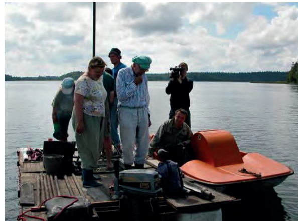
Fig. 3. The core of sediment sampling from Słupiańska Bay

degree to which it became popular, and therefore localization was carried out using field methods, i.e. setting azimuths on three characteristic points with a compass, which, with difficulties in staying on the point, gave an accuracy which ranged from several dozen to a hundred meters. It was only since year 2000 that the location was carried out using a GPS coupled with a computer, and it was possible to plan the sampling sites in advance to an accuracy of 5 m.