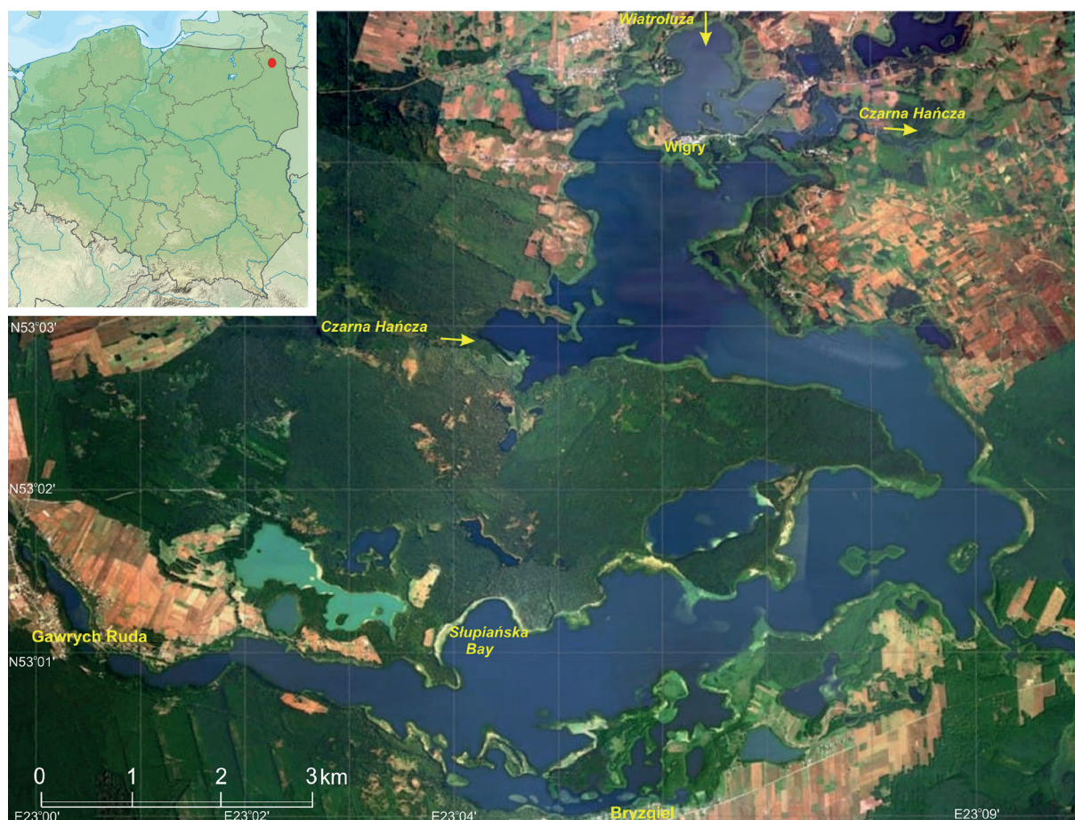
Fig. 1. Lake Wigry location (by TUBS – own work, this vector image includes elements that have been taken or adapted from files: Poland2 location map.svg (by NordNordWest) and Relief Map of Poland.png (by Bukmop_B), CC BY-SA 3.0, https://commons.wikimedia.org/w/index.php?curid=17535679 , access: 5.04.2021) and Lake Wigry photomap (obtained courtesy of the Wigry National Park authorities, corrected)