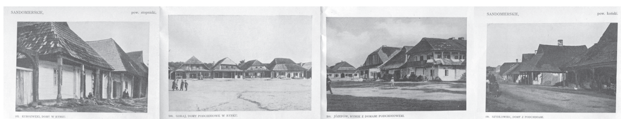
Fig. 2. Arcaded buildings of the Lublin region market squares