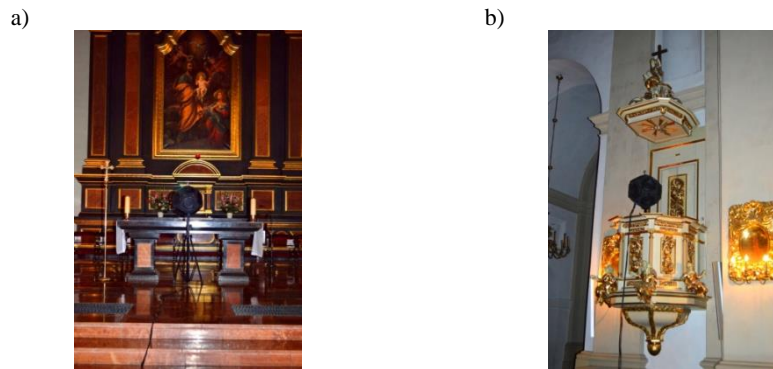
Figure 2. a) Omnidirectional sound source placed in front of the altar; b) omnidirectional sound source placed on the pulpit.

recommendations for investigations in churches [3, 4], while the selected acoustic parameters are recommended in the literature to carry out acoustic analyses in church interiors [5].