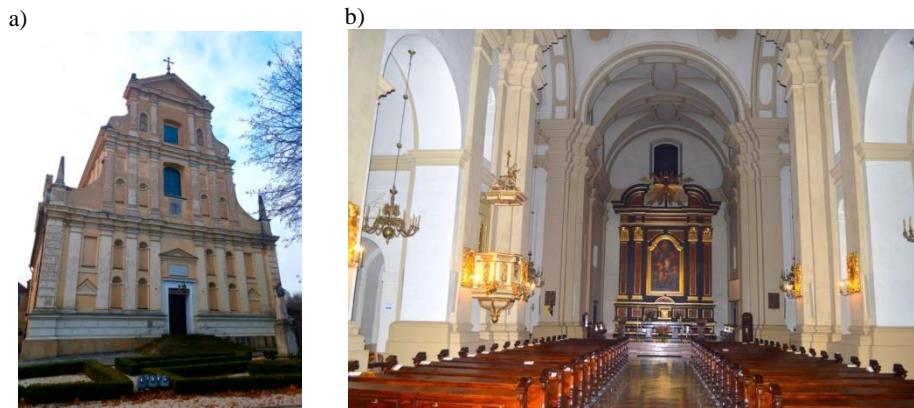
Figure 1. a) view of the church; b) church's interior

monastery of Discalced Carmelites was resolved. The religious buildings were used as stables as well as hay and straw storage facilities. Devastation of the interior of the church was complete when Napoleon's army passed Greater Poland. In the 1840s, the interior was rebuilt according to the design by Karl Friedrich Schinkel and transformed into a garrison evangelical church. Finally, in 1945, the war-damaged church and the monastery were returned to the Carmelites and then reconstructed. Year 1984 was the beginning of intensive renovation works, and the church was consecrated in 1990. It is built on the rectangular plan; its lunette vault spans over the nave and the presbytery; over the transept there is a barrel vault. In the entrance part of the nave, there is a gallery with the organ. The internal volume of the church is 8 700 m 3 . Although the style is Baroque, the interior features classic moderation and simplicity. Lesenes and cornices, with decorative niches made the rhythm of the façade [1, 2]. Figure 1a shows the building's façade; Figure 1b shows the building's interior.