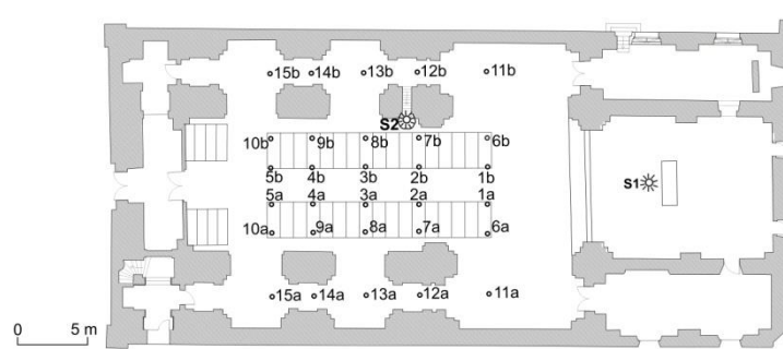
Figure 3. View of the church with marked sound source and measurement points.