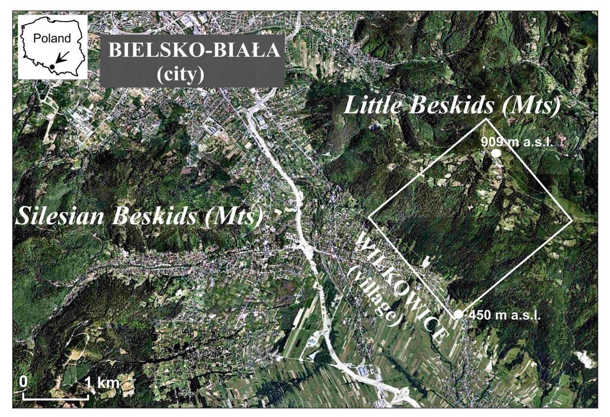
Figure 1. Location of the research area – marked as rectangle (based on Google Earth picture)

The Hg concentration was estimated using the LUMEX Ra-915+ atomic absorption spectrometer. In the case of soil samples, pyrolysis is first carried out in a special device (RP-91C attachment), which consists in a thermal release of mercury from the bond to the atomic state. The fumes with released mercury atoms undergo Zee-