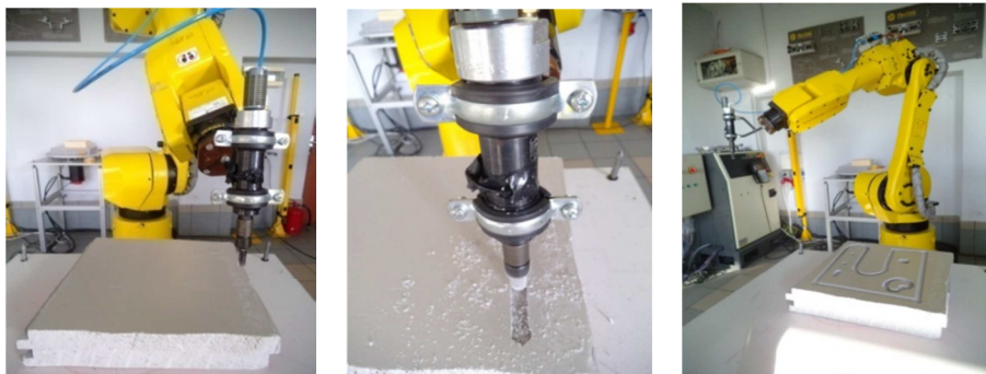
Fig. 1. The rapid prototyping station with Fanuc ArcMate100iB industrial robot

In the course of research the station with Fanuc ArcMate100iB robot (Fig. 1) was used (degrees of freedom - 6, maximum range of arm - 1373 mm, load capacity - 6 kg, position accuracy - 80 \mu\text{m} , semi-continuously regulated feed rate, the linear and circular interpolation). Due to parameters of the manipulator and pneumatic milling machine mounted in the robot wrist (nominal pressure - 6 bar, spindle speed - 2200 r/min, tool - end mill \Phi 12 mm) the study was started from easy-machinable materials (styrodur - XPS, plastics, machinable wax).