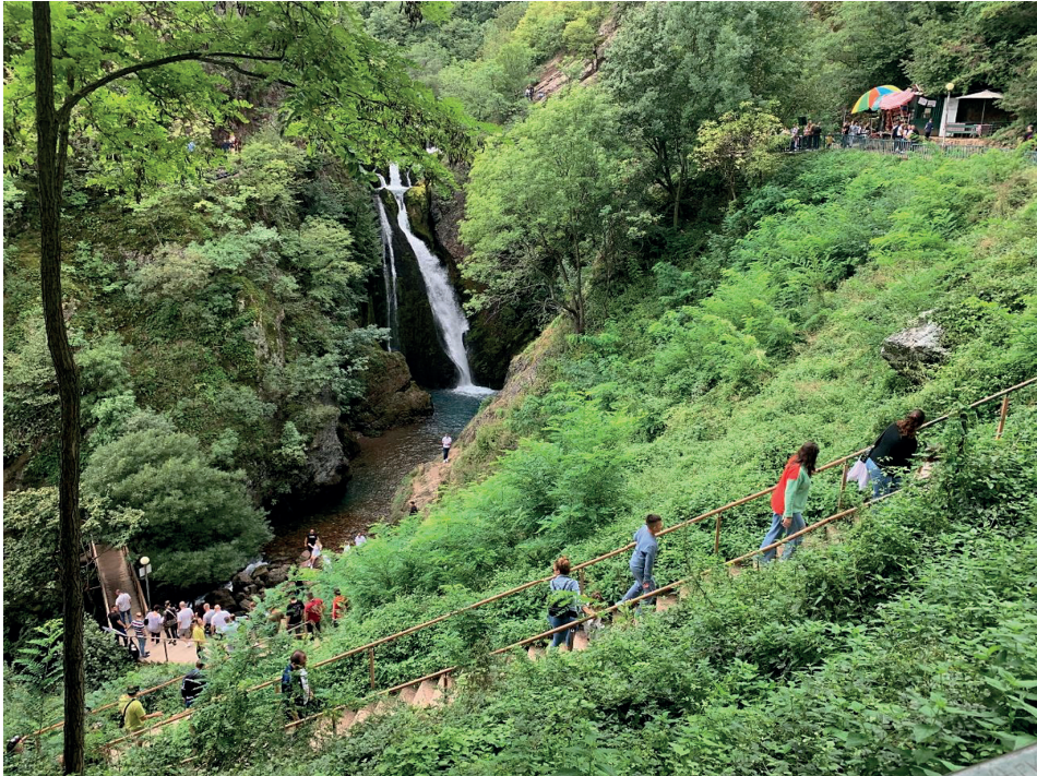
Fig. 2. Visitors to the source of White Drin