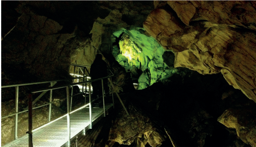
Fig. 4. Radac Cave «Sleeping Beauty»