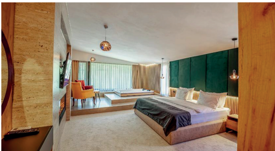
Fig. 5. Presenting Drini Waterfall Resort

channels, which were built in pre-Levantine time, the larger cave channels were created in the time of the lower lakes when the second gallery of the cave was formed. Enriched with decorations from