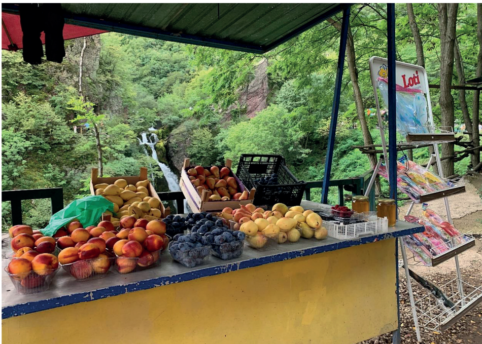
Fig. 3. Local fruits from Radavc village

providing tourist services and high quality. There you can find all kinds of food from traditional to modern food. The cave of Radac is located near the “White Drin” waterfall. It lies in the north-eastern part of the Rugova Mountains ranges. The cave is deepened in rocks, which make up the top of Rusolia with an altitude of 2381 m above