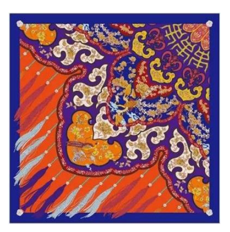
Fig. 1. WOO Brand Scarf

In the AW 2020 collection, the WOO brand introduced a digitally printed scarf called "Yunxia Yingri" ingeniously incorporating the four-piece Ruyi-shaped cloud shoulder element into the print design, capturing the essence of Oriental artistic aesthetics and auspiciousness. The vibrant red and orange colors evoke the image of colorful clouds elegantly surrounding the wearer's shoulders