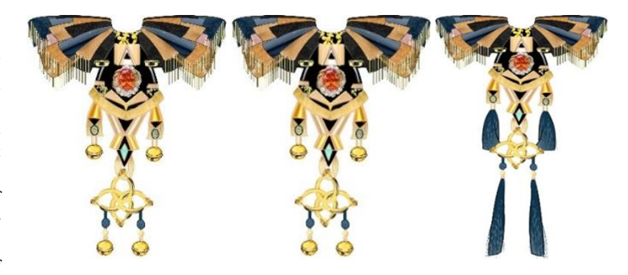
Fig. 7. "Alloy Prism" series design (Designed and drawn by the author)

Firstly, the protection and development of traditional culture require longterm efforts. The application of Hanfu elements necessitates respect and understanding of the connotations and