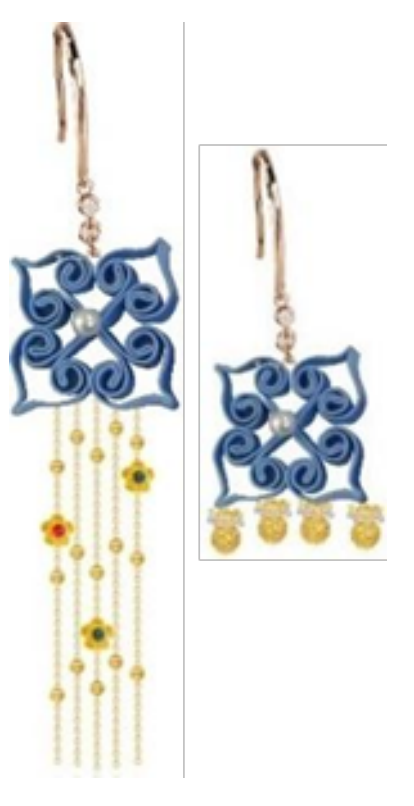
Fig. 8. "Alloy Prism" series earrings (Designed and drawn by the author)

To address these challenges, designers need to enhance their cultural learning, cultivate innovative consciousness, continuously improve their professional skills and craftsmanship, as well as understand and grasp consumer demands