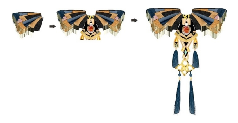
Fig. 6: Fusion of cloud shoulder forms (Designed and drawn by the author)

creation of unique works and provides new opportunities for the inheritance and development of traditional culture.