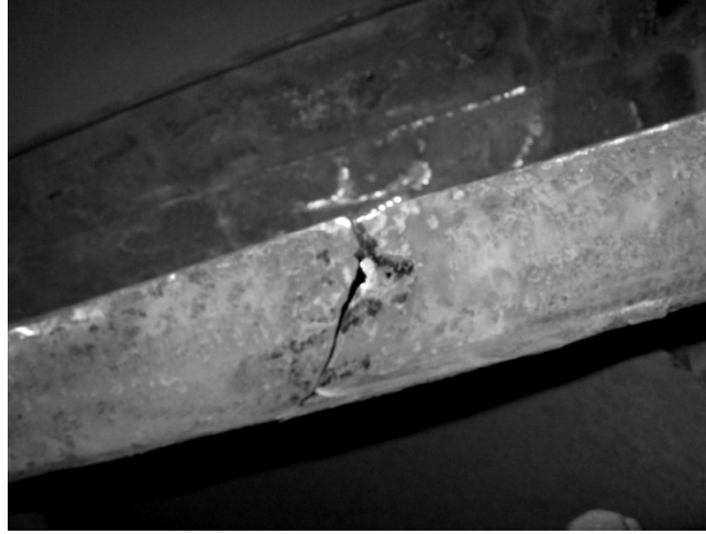
Fig. 1. Typical fatigue cracking in trucks' vehicle frame

structures of weld metal deposit with the composition 0.08% C, 0.8% Mn, 400 ppm O and 2% Ni or 0.4% Mo could be considered optimal because it corresponds with a high percentage of acicular ferrite AF (until 55%) that corresponds with the high-impact toughness of welds [12-13].