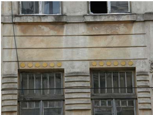
Fig. 23. Gradations of rustication (15 Doroshenka str.).

Rustication. The composition of most building facades of I. Levynskyy's Company is based on the rules of nature, namely on the growth of flower. Therefore, the area of the first floor as a rule was finished in a very restrained manner, opposite to the upper floors, heavily decorated. Often, rustication was the only decoration of the first, and sometimes second, floors. Secession rustication differed by its flatness. Often were used banded rustication (buildings in 42-44 Rustaveli str., 11A Hen.Chupryny str.), Greek rustication (5 Bohuna str., 14 Doncova str.), narrow Greek rustication (12 Doncova str., 38 Hen.Chupryny str.); belted (14 Doncova str., 1-3 Hotynska str., 6 Doncova str., 60 Hen.Chupryny str., 15 Doroshenka str., 4 Acad. Pavlova str.) and the imitation of the pseudo-isodomic masonry (4 Shevchenka Ave., 8-10A Doncova str.) (fig. 23, 24).