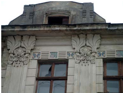
Fig. 34. Modified pilasters (7 Nalyvajka str.).