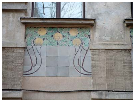
Fig. 37. Majolica panels (2 Pavlova str.). Source: il. T. Kazantseva, S. Ponkalo