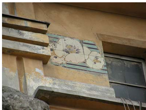
Fig. 39. Majolica panels (3 Pavlova str.).