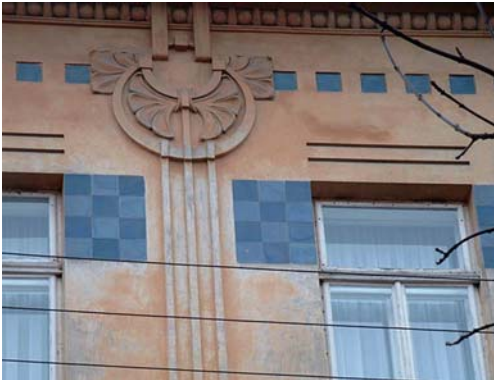
Fig. 31. Modified order forms (8 Bohomoltsia str.).

str.), wreath (8 Acad. Bohomoltsia str., 4 Acad. Bohomoltsia str., 14-16 K. Levytskoho str., 70 Lychakivska str.). The height of capitals increases, the composition becomes more complicated, such as a wreath attached to one another with ribbons. In several cases body of molded pilasters is absent, pedestal is mostly disappeared too, but in few cases is preserved (fig. 31-34).