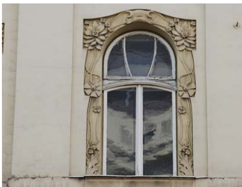
Fig. 5. Arch window (4 Shevchenka Ave).

Window frames mainly were decorated with plant motifs, smooth flowing lines of stylized flowers, leaves and stems of plants (6 Acad. Bohomoltsia str., 6 Shevchenka Ave, 3 Acad. Pavlova str.). In the frames of geometric forms also volutes and keystones occur. Classic cornices with the broken pediment and keystone in the middle were placed above the windows (38 Chupryny str.) (fig. 5-8).