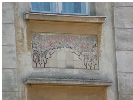
Fig. 35. Majolica panels (70 Lychakivska str.).

color panels was quite different. Blue, burgundy, purple and azure colors of the tiles were used very often, green, orange and yellow, which combined in "the chessboard" composition (5 Bohuna str., 2-4 Hryhorenka sq., 8-10 Doncova str., 11 Chuprynyky str.) were used more rarely. Sometimes "chessboard" panel intentionally was made of not two, but several tints related to each other (e. g. blue, cobalt, light and dark green). This picturesque method made the surface of majolica panels to be similar to painting and allowed to avoid monotony through alternating of the same colors. Tiles in ornamental panels on the facades of I. Levynskyy's Company combined in two ways – in thematic panels with free composition (1 and 2 and 3 Acad. Pavlova str., 70 Lychakivska str.), and in panel with metric repetitive elements of ornament (4 Acad. Bohomoltsia str.) (fig. 35-40).