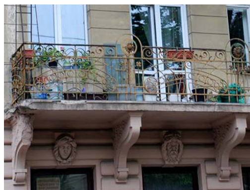
Fig. 12. Balcony stone brackets and wrought fences (38 Chuprynki str.).