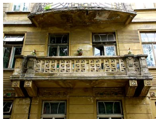
Fig. 10. Balcony stone brackets and stone fences (5 Bohomoltsa str.).