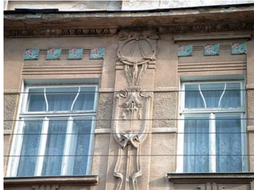
Fig. 25. Molding between windows (1 Pavlova str.).