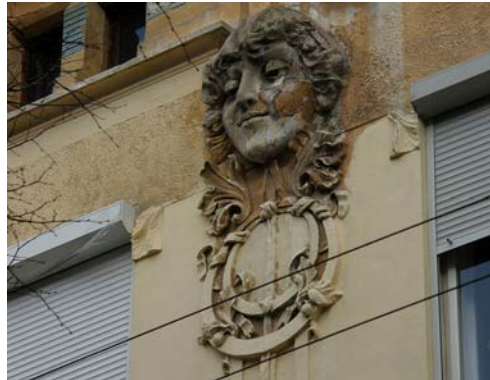
Fig. 32. Capital-mask (3 Pavlova str.).