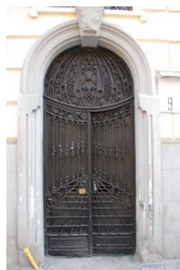
Fig. 2. Arch portal (9 Dudajeva str.). Source: il. T. Kazantseva, S. Ponkalo: