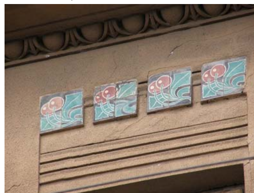
Fig. 40. Majolica panels (1 Pavlova str.). Source: il. T. Kazantseva, S. Ponkalo