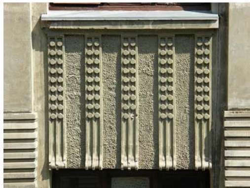
Fig. 29. Molding with plaster texture (1 Hotynska str.).