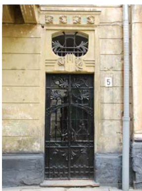
Fig. 3. Rectangular portal with a curved fanlight (5 Bohomoltsya str.).

The doors were typically forged and much less were wooden. Ensemble of entrance portals was often supplied with fanlight placed above the door (buildings in 5 and 6 and 8 and 9 Acad. Bogomoltsa str., 1 and 2 and 3 and 4 Acad. Pavlova str., 7 Bohuna str., 60 Hen. Chupryny str., 6 Doncova str., 46 Kopernika str.) (fig. 3, 4). Unlike the entrance portals, window frames were usually wooden.