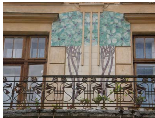
Fig. 38. Majolica panels (4 Pavlova str.). Source: il. T. Kazantseva, S. Ponkalo