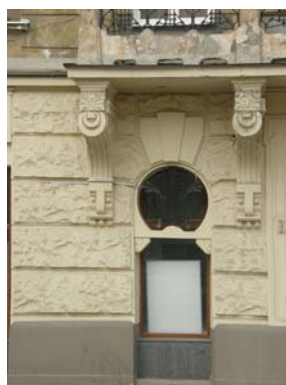
Fig. 4.: Portal with a round fanlight (4 Grygorenko sq.).

Window frames mainly were decorated with plant motifs, smooth flowing lines of stylized flowers, leaves and stems of plants (6 Acad. Bohomoltsia str., 6 Shevchenka Ave, 3 Acad. Pavlova str.). In the frames of geometric forms also volutes and keystones occur. Classic cornices with the broken pediment and keystone in the middle were placed above the windows (38 Chupryny str.) (fig. 5-8).