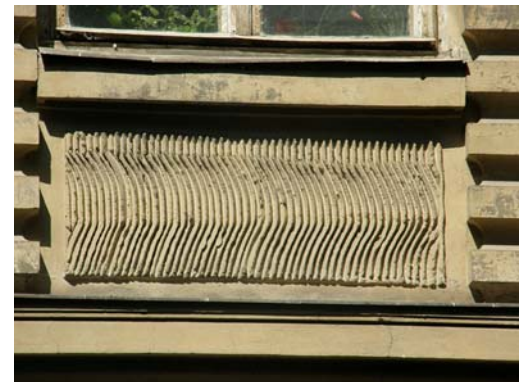
Fig. 30. Molding with plaster texture (14 Dontsova str.).