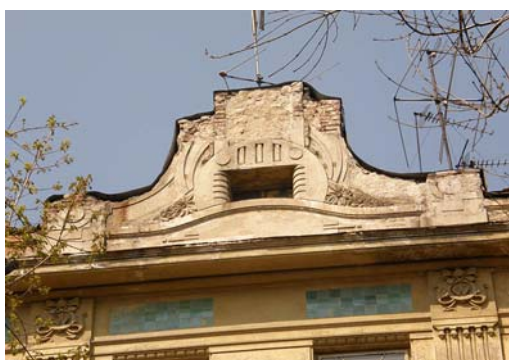
Fig. 21. Curved shaped attic (5 Bohomoltsa str.).