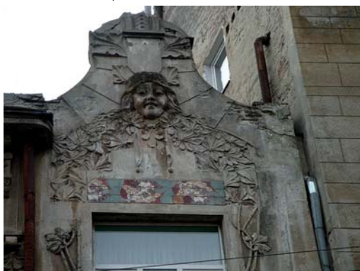
Fig. 17. Attic with mask and molding (4 Bohomoltsa str.).