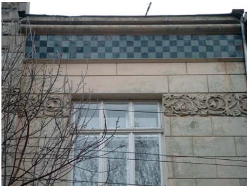
Fig. 13. Cornice with majolica (5 Boguna str.).

Attics and cornices have gained the paramount importance on the buildings' facades made by I. Levynskyy's Company. Deeply connected with historicism, Lviv Secession spirit was realized mainly in the final part of facades where wavy lines and planes were used. Secession architects were not trying to display architectonics on the facade by applying heavy volumes on the first floor and by gradual alleviation of molding's and sculpture's relief on the upper floors. The architecture and art of the Modern Style were characterized by admiration and imitation of nature (through stylization). Therefore, the composition of the most of the Secession facades is based on the rules of nature, similar to irregular pulsating rhythm of biological processes in which tension increases upwards. Cornices play a significant role in the façade's architecture. On the facades of buildings made by I. Levynskyy's Company cornices were used mostly above the first floor, as well as cornices under and over the windows. The profile of all this elements was simplified (often rectangular). Much complicated in design was entablature cornice, which was consisted of a number of architectural moldings (often non-classical) and supported by corbels or wrought iron brackets (fig. 13, 14).