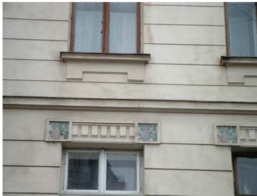
Fig. 24. Banded rustication (7 Nalyvajka str.).

Molding has received the greatest development in early Secession (till 1908), when New Style architects were searching for a new ornament. So facades of I. Levynskyy's Company were covered with floral ornaments, prototypes of which were the native plants (chestnut, linden, oak, chamomile, poppy and chrysanthemum). Molding of the late period of Secession was characterized by stylization of ornamental elements of previous architectural styles (garlands, oval elements of Ionic order, cartouches, volutes, etc.). Almost plane ornament was often located on high-relief background, which increased importance of molding and visually made the ornament more planar.