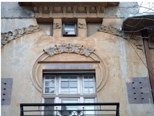
Fig. 7. Rectangular window with round frame (3 Bohomoltsa str.).