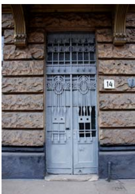
Fig. 1. Rectangular portal (16 Levytskoho str.).

Entrance portals and windows are one of the leading types of structural decoration. They are special in the forms of openings and their decorative ornaments. Based on investigations of Lviv buildings facades, designed by I. Levynskyy, we can state that the forms of openings of the entrance portals and windows are usually rectangular (buildings in 4 Bohomoltsia str., 4 Bandery str., 1 Acad. Pavlova str., 70 Lychakivska str., 8 Doncova str., 38 Hen. Chupryny str., 20 Doroshenka str., 14 Levytskoho str.) (fig. 1), arched (2 Hen. Chupryny, 4 Shevchenka Ave., 4 Briullov str., 6 Bandery str., 9 Dudayeva str., 12 Vyshenskoho str., 2 Hlibova str.) (fig. 2) and sometimes tryforium (11A Hen. Chupryny str.). Diversity of openings forms is achieved due to decorative window and doors frames in the form of original archivolt.