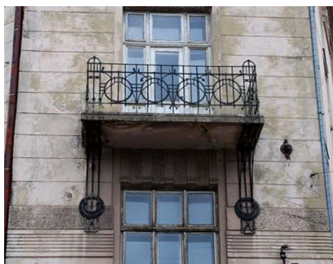
Fig. 9. Balcony with forged brackets and fence (1-3 Hotynska str.).