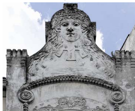
Fig. 18. Attic with mask (4 Bryulova str.).