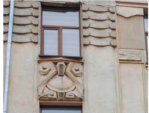
Fig. 26. Molding with neoclassic volutes under windows (2 Bandery str.)