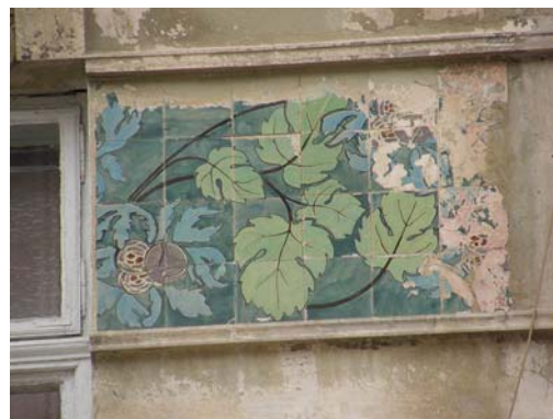
Fig. 36. Majolica panels (5 Bohuna str.).