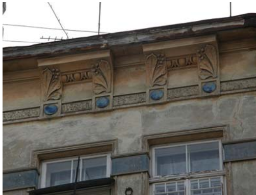
Fig. 14. Cornice with leaf brackets (15 Doroshenka str.).

On the facades of I. Levynskyy's Company such schemes of attic composition were spread, as: a) covering of the attic plane with ceramic tiles entirely (12 Doncova str.) or as an archivolt (2-4 Hryhorenka sq.); b) attic's decoration by female or male masks (4 Briullova str., 4 Acad. Bogomoltsia str.); c) molding with floral forms (4 Shevchenka Ave., 70 Lychakivska str.) or historical motifs (44 Rustaveli str.), combination of columns and wrought iron fences (3 Acad. Bohomoltsia str., 38 Hen. Chupryny str.); d) covering with plaster texture (buildings in 42 and 44 Rustaveli str., 3 Hotynska str.). Cornices on facades of I. Levynskyy's Company buildings can be divided into: a) profiled (buildings in 3 and 6 Acad. Bohomoltsia str.), b) with console ledges or corbels (5 Bohuna str., 38 Hen. Chupryny str.), c) with dentils (3 Acad. Pavlova str., 17-19 Kotlyarevskoho str., 2 Bandery str.), d) with Egg-and-dart molding (2 Hlibova str., 4 Briullova str.) (fig. 15-22).