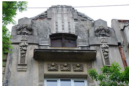
Fig. 16. Attic with floral molding (14 Doncova str.).