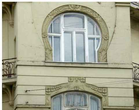
Fig. 8. Horseshoe window with curved frame (3 Pavlova str.).