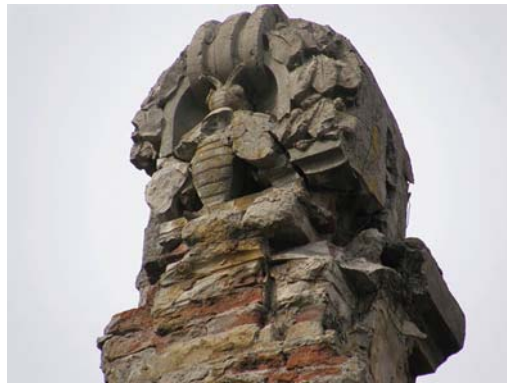
Fig. 27. Molding on the attic (2 Hlibova str.). Source: il. T. Kazantseva, S. Ponkalo