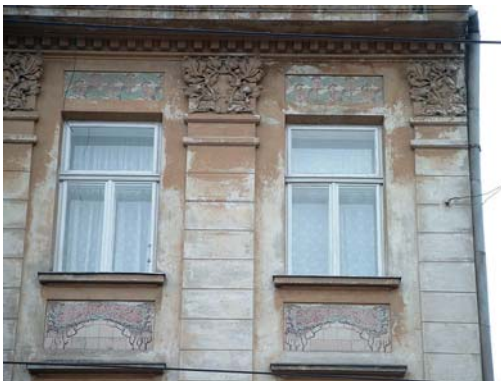
Fig. 33. Modified pilasters (70 Lychakivska str.).