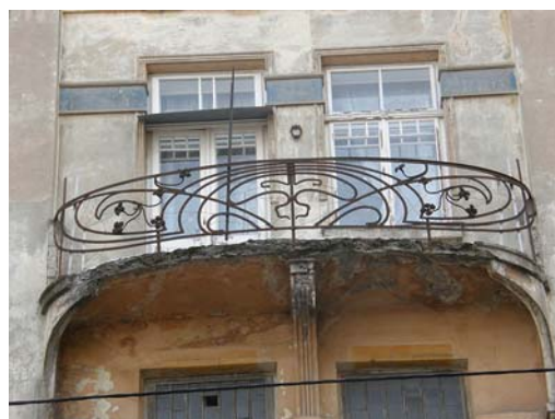
Fig. 11. Balcony stone brackets and wrought fences (15 Doroshenka str.).