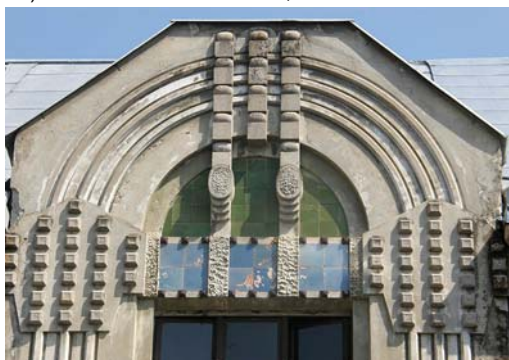
Fig. 19. Trapezoid attic with majolica tiles (8-10 Dontsova str.). Source: il. T. Kazantseva, S. Ponkalo