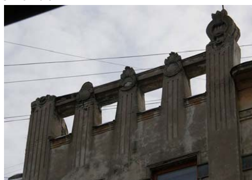
Fig. 22. Attic as a balustrade (15 Doroshenka str.). Source: il. T. Kazantseva, S. Ponkalo