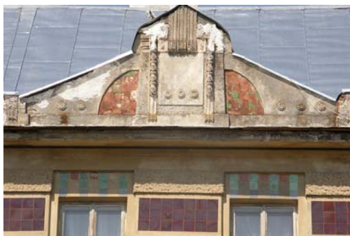
Fig. 15. Attic with majolica (10 Doncova str.).