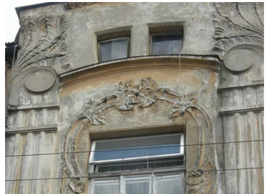
Fig. 28. Molding around the window and on the attic (14 Dontsova str.).