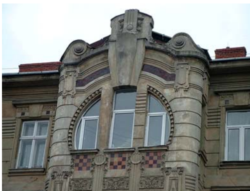
Fig. 6. Attic round window (4 Grygorenka pl.).