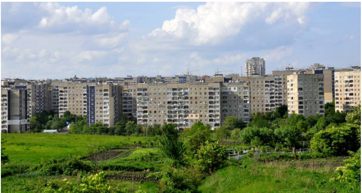
il. 4. View of housing estate of Sykhiv from the vegetable garden