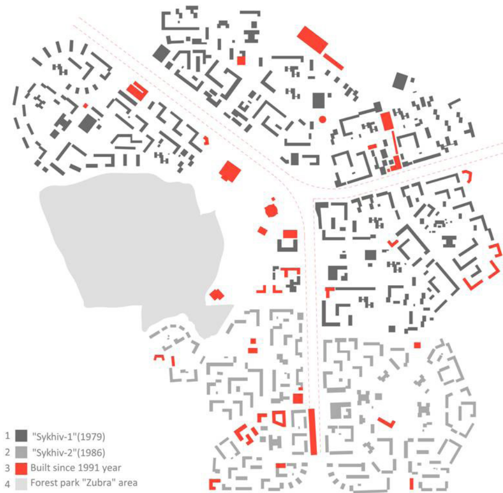
il. 3. Phasing scheme of housing estate Sykhiv construction, 1979–2012. (©Bogdan Cherkes, Natalia Mysak)