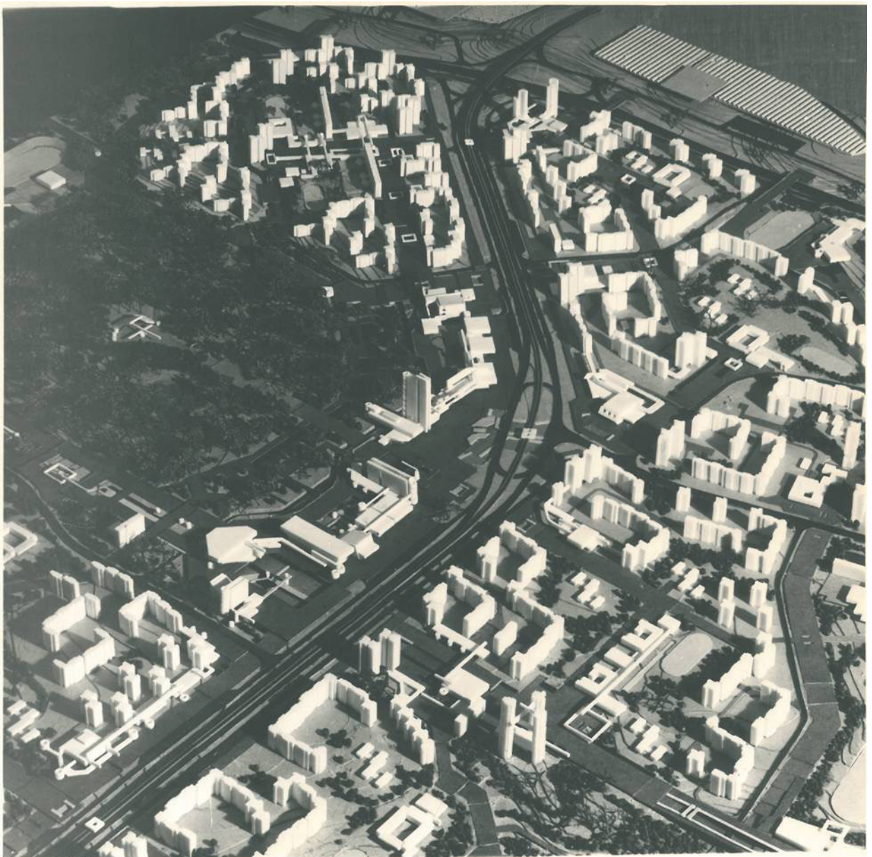
il. 2. Photo of the Sykhiv model, 1975.