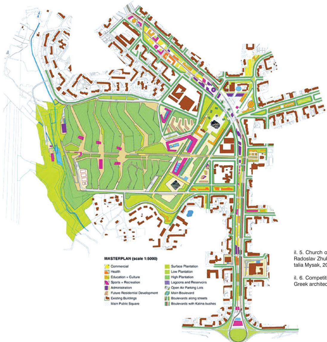
il. 5. Church of Nativity of the Holy Virgin, architect – Radoslav Zhuk, 1995–2001. (©Bogdan Cherkes, Natalia Mysak, 2012)