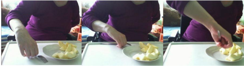
Fig. 4. Patient with spastic upper limb while eating without the use of AKJ.

correctly it will be a sign of a considerable improvement. This is a functional test of the AKJ "Szermierz".