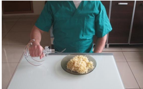
Fig. 1. Prototype of assistive eating apparatus.

manufacturing method FFF (Fused Filament Fabrication). It belongs to a group of methods, where the process of creating a three-dimensional element is done in a layered manner by applying plasticized material and supporting material in the form of thin filaments using one or two heads (Fig. 2) 3 . The numerically controlled head has the ability to move in the X, Y axes by applying the desired shape on the working platform.