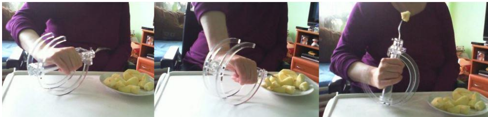
Fig. 5. Patient with spastic upper limb while eating with the use of AKJ.