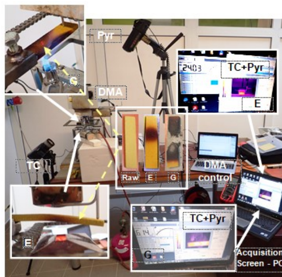
Fig. 3 Modified Hot Distortion measuring stand and information on the test details. DMA - HD control unit, TC - Thermovision camera, Pyr - Pyrometer, E,G - heating by electric radiator/gas burner, Raw-E-G - state sequences of Croning sand samples after heating by E (Electric) and by G (Gas) method

Next Figure presents photographs of heating sources in both the cases (a radiator and a gas burner), as well as organization of a work stand and measurement systems (Fig. 3). A comparative study of a specimen out of Croning sand was performed. The results are presented in diagrams – Fig. 4.