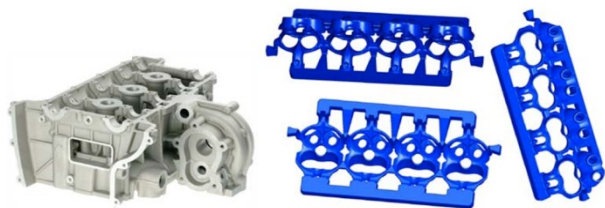
Fig. 1 Example of an Al-Si-Cu cylinder head with complex thin-walled inner cores. [3]. Indication of knocking out ability problem

It is a well-known fact that thermomechanical phenomena decide about casting quality features, including fulfillment of dimensional tolerances by a raw casting, as well as defects in reference to its intermediate and final state of stress. In some cases it may manifest itself by deformation or even fractures. This state is dependent on the alloy type and shape of the casting (inhibition of the shrinkage), as well as on technology of mold and its material. Another problem worth of indication is cores' susceptibility to be knocked out, especially regarding castings out of Al-Si alloys (with a relatively low temperature of binder degradation), of complex configuration and relatively thin walls, e.g. engine heads (Fig. 1) [3]. This problem requires constant awareness of a given foundry and proper selection of resin binders, to prevent lack of patency of water jackets in an engine.