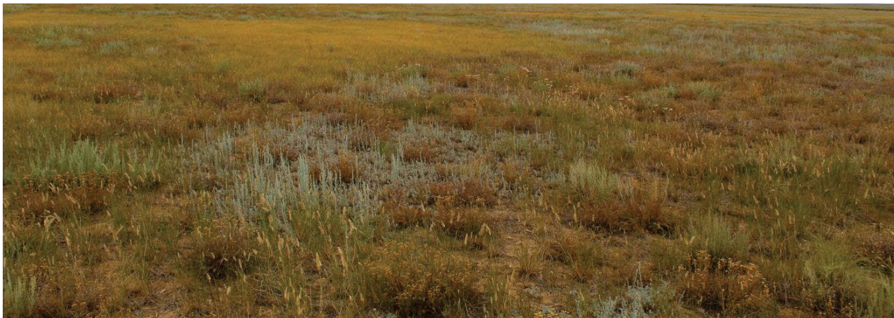
Photo 2. Self-restoration of vegetation in the area of the former pasture ( B1_c ) subzone of kastanozem soils

We recorded vegetation on pastures and fields of AAES not used for arable farming. For example, Photo 2 shows natural vegetation where wheatgrass from neighbouring crop plots is found. Plants, which are located on the surface of the soil in spots, have a difference in botanical composition. This emphasises the presence of areas with a high salinity of kastanozem soil and the presence of solonetztes. The vegetation consists mainly of Artemisia , Leymus ramosus , Bassia scoparia , Festuca , Stipa and other plants. The projective cover of the area is about 60–80%. The function of the soil in natural conditions in any year, at