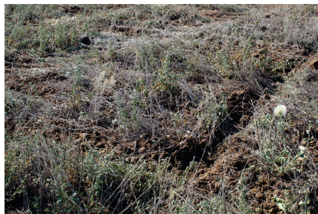
Photo 1. The field after tillage with a flat cutter as a way to protect soil from wind and water erosion, the effect of soil mulching

as protection of soil from wind and water erosion to the function of unused fields. After the beginning of deposits' usage, the effect of soil mulching is observed. We can present this in the Photo 1 after tillage with a flat cutter.