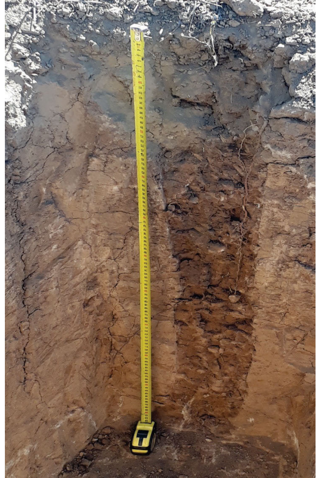
Photo 4. Structure of kastanozem soil ( C2_c )

a depth of 110 cm (Photo 4). Carbonates are visible at depth on the front wall of the soil section. There is a horizontal layer of gypsum deeper than 90 cm. In the photograph, it is a white strip of crystalline gypsum up to 2 cm thick. Gypsum goes with carbonates in streaks from 90 to 110 cm and deeper (Photo 4).