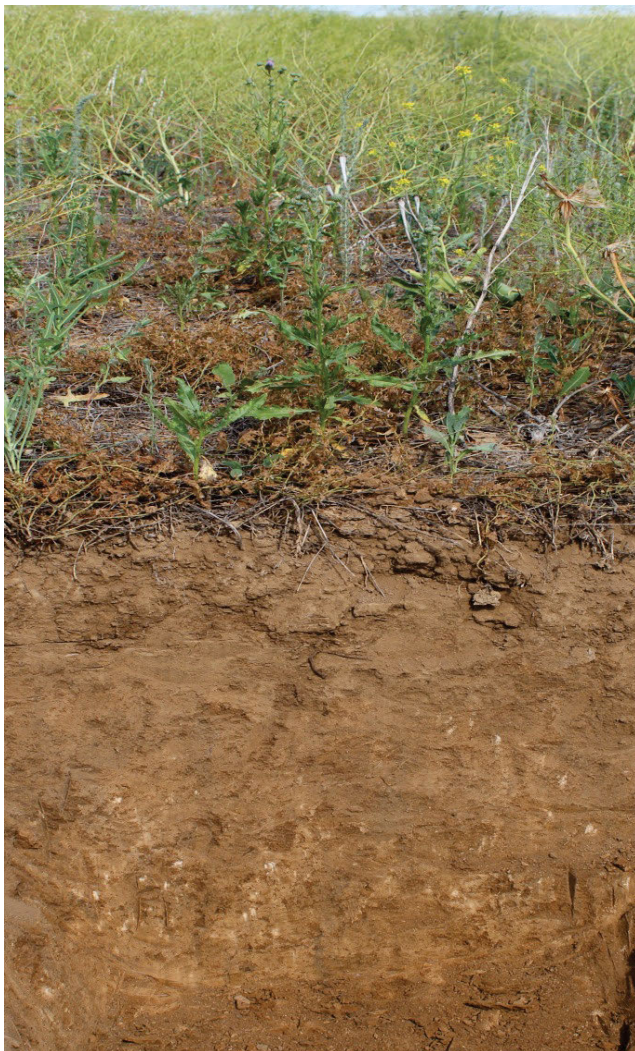
Photo 3. Reflection of the soil-plant systemic relationship ( C2_c )

Also, in order to assess the change in the state of the former arable kastanozem soil, we made an inspection of the vegetation in the middle of summer. To assess the change in C2_c of kastanozem soil, the authors of this article, during the period of expeditionary observations, dug up the soil in the middle of summer on the former arable land. The vegetation shown here has developed naturally on the soil (Photo 3), it is a field without cultivation for more than six years. Vegetation over 60–70 cm high was observed in Erysimum cheiranthoides , for Sonchus arvensis – up to 60–70 cm, and Bassia scoparia , – from 10 to 60 cm. Convolvulus arvensis was observed in significant numbers. Lactuca serriola was from 10 to 60 cm tall. Projective cover area (S) was 50–60%.