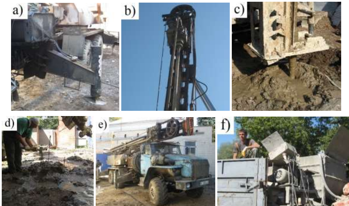
Figure 4.1. Deep soil mixing technology of manufacturing the reinforced soil-cement piles: a) supports deployment, b) boring tower deployment, c) boring, d) reinforcing with steel bars, e) relocation the boring machine to next pile, f) mixing station

Manufacturing the RSCP by DSM technology consists of following procedures: supports deployment, boring tower deployment, boring (supplied with cement mortar providing its operation), reinforcing with steel bars, relocation the boring machine to next pile (fig. 4.1.)