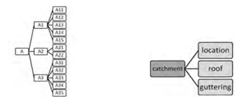
Fig. 1. General hierarchy example - part A Fig. 2. Sub-section hierarchy