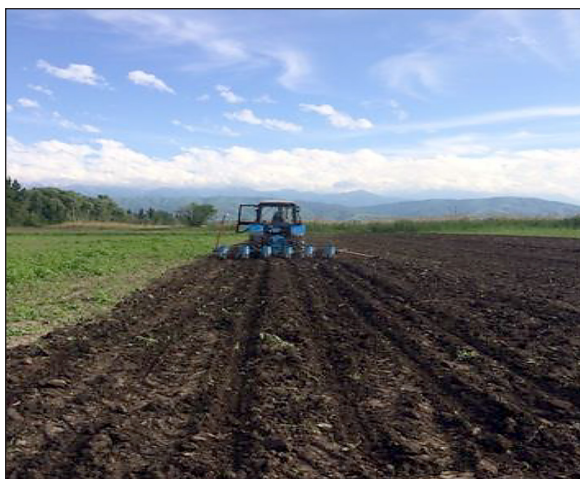
Figure 2. Field experiment layout