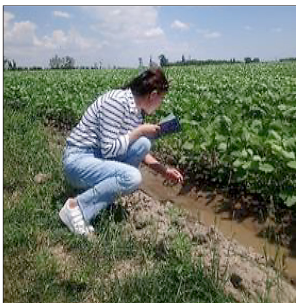
Figure 5. Determination of the density of rapeseed herbage in the field experiment

The dynamics of the volumetric weight of the arable layer of soil show that during the growing season, the density of the soil increases