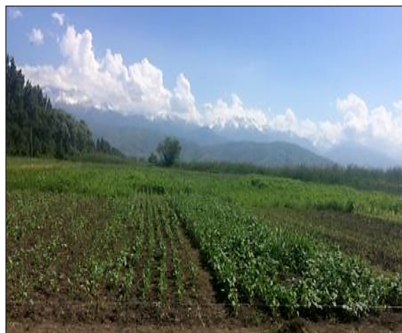
Figure 3. Soybean sowing during the germination and stem extension period

content of 4.40–4.45%, easily hydrolyzed nitrogen content of 87 mg/kg, the potassium content of 435.1 mg/kg, and mobile phosphorus content of 22–25 mg/kg of soil. The meadow-chestnut soil of the studied zone, in terms of its water-physical properties and the level of potential fertility, fully satisfies the conditions for the cultivation of all types of crops, including oilseeds.