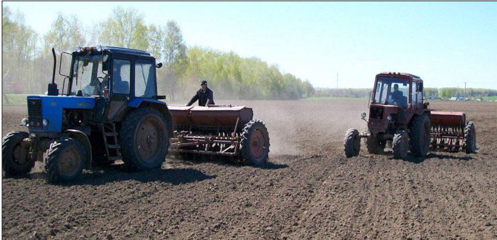
Figure 1. Field experiment layout, rapeseed sowing period