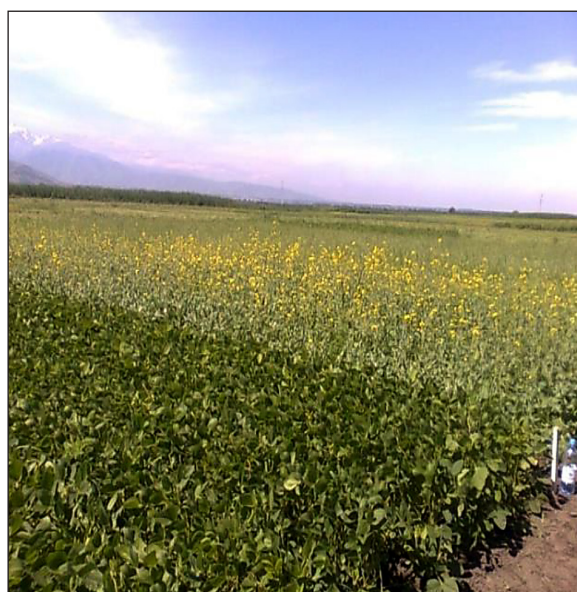
Figure 6. The onset of rapeseed phenophase, flowering