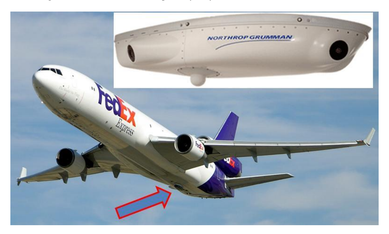
Fig. 5. Northrop Grumman Guardian on a FedEx MD-11 [13]

Another country that develops on-board anti-missile systems for civil aircraft is the USA. On 21 December 2008, the US Department of Defense signed a contract with BAE Systems for this type of equipment. Under this contract, anti-missile systems were to be installed on aircraft belonging to American Airlines flying between New York and California [8]. The similar Guardian system has been developed by Northrop Grumman, which is civilian variant of the AN/AAQ-24 (V) Nemesis military system. Guardian can be placed almost anywhere on the fuselage and increases fuel consumption by only 3-4% [8].