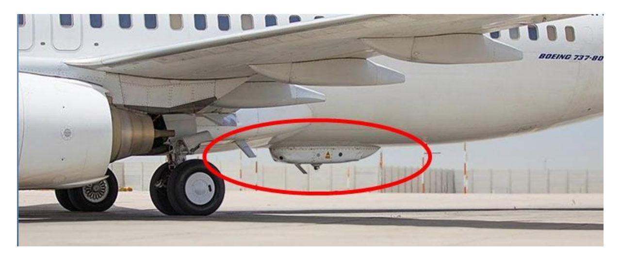
Fig. 4. C-MUSIC system on a Boeing 737-800 belonging to El Al

Rafael's Britening system has sensors for the detection of incoming missiles, which are triggered by changes in heat in the environment. If this occurs, the Britening system generates a powerful beam of light, which interferes with the guiding system of the missiles [8, 9, 14, 15]. It can protect against light-guided missiles, especially during take-off and landing, while the system works automatically. The Britening system is based on the Aero-Gem protection system for military helicopters, with costs of around two million US dollars. Another similar system is the Israeli IAI/Elta Flight Guard, which working in a similar way to the Britening system except that it detects missiles using Doppler radar. IAI says that the Flight Guard offers 99% efficiency and is able to operate in any weather conditions. The system weighs 60 kg, with dimensions of 306 x 361 x 207 mm, and consumes 500 W of energy [11].