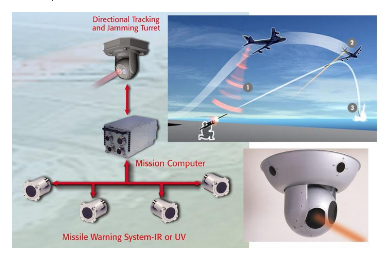
Fig. 3. Rafael Britening system: 1) detection of attack, 2) rocket jamming [11]

The means to mislead enemy missiles have long been known in military aviation. These mainly include on-board or suspended pods, which emit energy to jamming systems, as well as rocket flares and chaffs (aluminium strips). They are used to jam homing infrared systems (flares) and radar systems (aluminium strips) of flying missiles. The civilian aviation community is also interested in such devices.