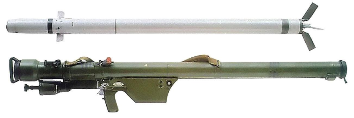
Fig. 2. The 9K34 Strieła MANPAD rocket launcher (USA/NATO code SA-7 Grail) [7]

fedayeens, who were accompanied by a French journalist; indeed, it is speculated, that her presence (and, consequently, the likelihood of appearing in the media) provoked the attack. The explosion of the rocket damaged one of the fuel tanks and caused a fire. That said, it did not explode because, paradoxically, it was almost full (vapours are the main cause of the firing and exploding of fuel; but, in this case, there was not enough space to produce sufficient vapours in an almost full tank). However, the airplane experienced a leak of hydraulic fluid, resulting in the loss of hydraulic power in the steering systems. After about 10 minutes, the crew managed to regain some control over the airplane and mechanically lowered the landing gear. The first landing attempt was unsuccessful because the airplane was too high. The second attempt was successful and the Airbus landed. During taxiing after touchdown, the A300 went off the runway and stopped outside the airport. The evacuation of crew was very difficult due to the fact that the airplane landed on a minefield. However, all were rescued.