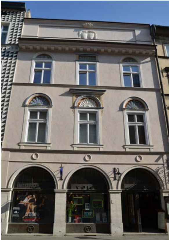
Fig. 10. The façade of the tenement house at 47 Floriańska Street (1821–1827) upon recovering the Biedermeier colouring