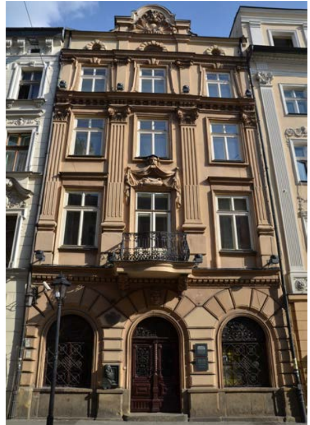
Fig. 11. The façade of the house of Jan Matejko, 41 Floriańska Street (1873, Tomasz Pryliński). Monochromatic colouring originated in Historism