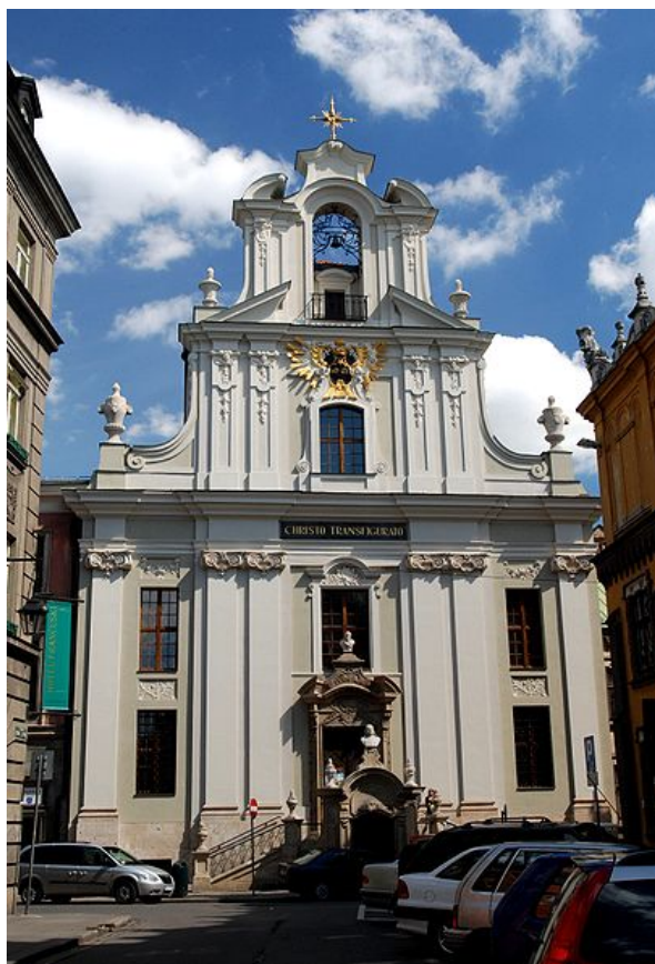
Fig. 5. The façade of the Church of Piarists (1759–1761, Franciszek Placidi). Cool colouring originating from the erection period

equivalent of the said Wrocław church in Krakow is the façade of the Church of Piarists originating from the 1750s (Fig. 5). The trend was common in Kraków also in secular architecture, though it developed a local modification – in the entry of the analyst Kazimierz Girtler made in 1809, information about a house in Szpitalna Street was found; grey walls of the house were “painted grey around windows which resembled stone frames, just as it had been used in the times of the king Jan III and the Saxons” (Girtler 1971: 59).