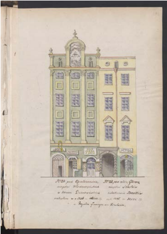
Fig. 8. Tenement houses at 13 Rynek Główny. Here seen before renovation works carried out in 1838 and subsequent joining of the buildings. A watercolour by Józef Louis stored in the Jagiellonian Library, record no 5925, card no. 273. Bright colouring of facades, with colour marked decoration elements

There were more and more yellow and ochre shades (Borowiejska-Birkenmajerowa & Demel 1963: 103), and these would prevail in the course of time (Fig. 9). The Biedermeier would also use a delicate decoration (Fig. 10). The trend of bordering windows with darker bands would still remain.