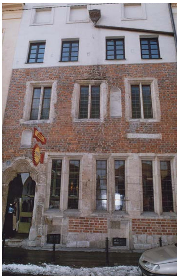
Fig. 3. The tenement house at 8 Szpitalna Street (the 14 th /15 th century). Plastering of its medieval brick facade was stripped off during restoration works carried out in the 20 th century

on the façades of tenement houses in Brzeg and Wrocław (Chorowska & Lasota 2004: 43, ill. 7). According to the text of Bartłomiej Stein written in 1506, tenement houses in the Market Square of Wrocław had “decorated façades, painted different colours” (Pieńczewska 1978: 41). On the basis of research into the façades of the Cloth Hall (Sukiennice), which was decorated “with a polychromy containing a thin, only a few-centimeter thick mortar layer and painted red with white mortar joints” (Jamroz 1983: 145), one may assume that tenement houses of Krakow could have been similarly decorated, whereas their stonework could have been “colourful”. Some mansions too had “painted” façades, among others, the residence of Kurozwęcki dating back to the first half of the 15 th century, located in the corner between Podzamcze Street and Kanonicza Street (Bogdanowska 1972: 20).