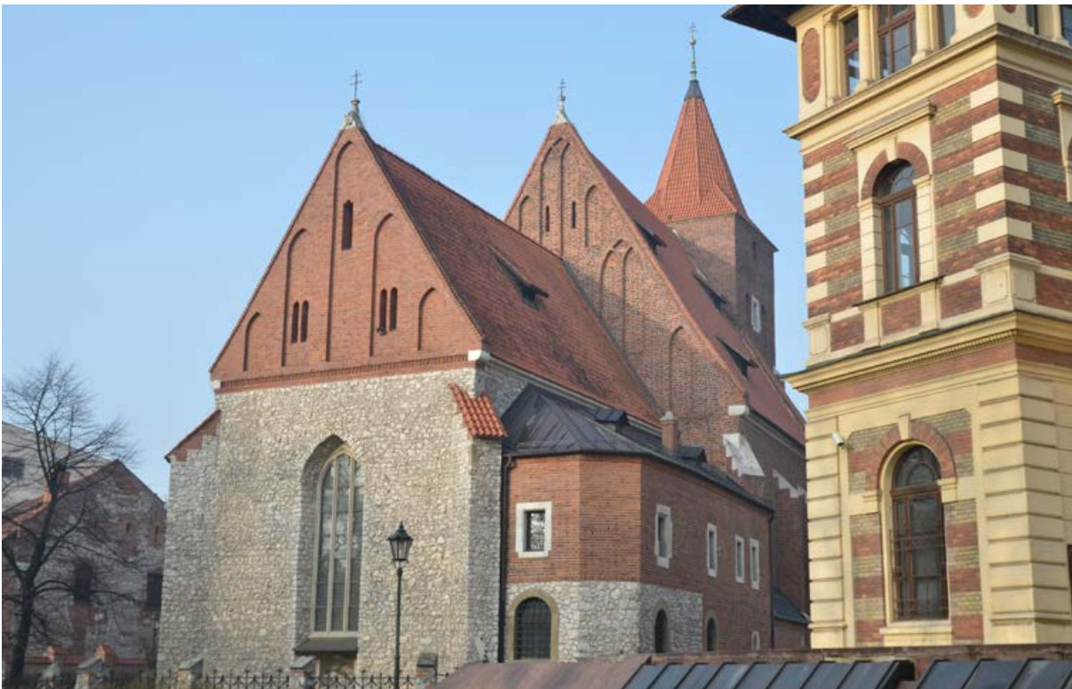
Fig. 1. The Church of St. Cross (the 13 th /14 th century and the 15 th century) and a part of the utility building adjoining the Słowacki Theatre (1893) as seen from the eastern side. Plastering was removed from the Church walls at the end of the 19 th century. The utility building retained its original plastering

Under the scrutiny of a conservator, everything what had the “gothic” shape, would shake off this inelegant plaster dress. Zygmunt Hendel and Tadeusz Stryjeński deleted the plaster from the Church of Saint Cross (Tomkowicz 1896: 79) at the end of the 19 th century (Fig. 1), while Sławomir Odrzywolski took the plaster off the eastern wing of the Augustian monastery at the beginning of the next century (Tomkowicz 1908: 72). Justifiably, respectful buildings as those could not be marred by lichen covered plaster. Lamentably, the bell tower of the Church of St. Mark, known to have been erected by master Krzysztof Żelasko in 1617, was “peeled” as well. As a result, there came to light poor building skills of the craftsmen, who must have known that the building would be plastered anyway (Paciorek 1996: 198–203, Komorowski & Follprecht 2007: 235).