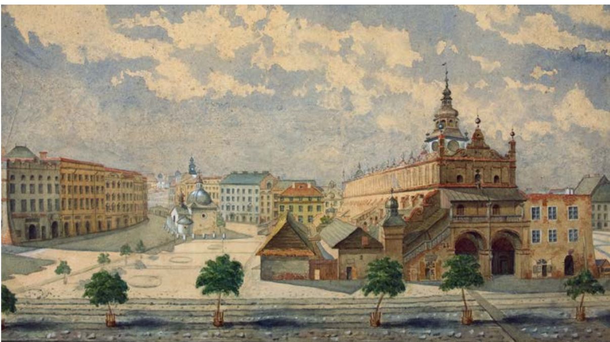
Fig. 9. The eastern half of the Market Square, as seen from the north. A watercolour from 1860, The National Museum in Krakow, record no. III, 10067. Bright colouring of facades

In the Art Nouveau 'multicolour' becomes a policy (Wallis 1984: 166–168). It can be obtained through the use of paint but also texture and material. The layout of these would either be subtle or contrasting, but always tasteful. Buildings were a sculpture or a painting. Among such successful and prestigious projects one may single out the Old Theatre (Stary Teatr, 1903–1906) (Fig. 12) and the Palace of Arts (Pałac Sztuki, 1898–1901).