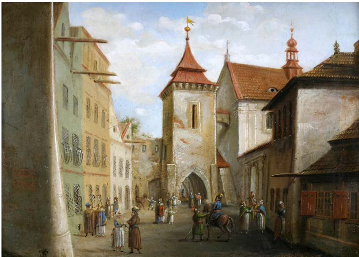
Fig. 6. The Mikolajska Street close to Gródek at the beginning of the 19 th century. An oil painting by Teodor Baltazar Stachowicz, The Historical Museum of the City of Krakow, record no. 244/VIII. Bright colouring of façades; the Mikolajska Gate, the Church of Dominicans and convent painted various shades of white. Window shutters and frames of the house in the right corner painted red

among others, subsequent versions of façades of the Church of St. Anne. This is not perhaps the place to refer back to them, however, one may say that nine changes of the façade colour resulted in the colour not quite reminiscent of the original shade, gaudy for contemporaries and including ideas which presently would be unacceptable, such as plastering stone elements and painting brick motif imitation (Dettloff 2010: 131–134). The history of the colour used for the façade of the Church of St. Anne shows how a historical monument was adapted to fit the tastes of a particular age, and this is also observed of late. We do like the façade now, but would people of the Baroque like it as well?