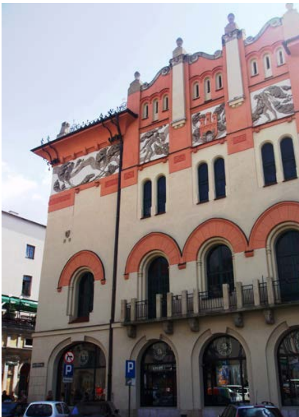
Fig. 12. The Old Theatre (Stary Teatr) (1903–1906, Tadeusz Stryjeński, Franciszek Mączyński). Recovered Art Nouveau colouring originating from the erection period

Similarly to the 19 th century, one of important new materials used for finishing façades was so called Roman plaster, while in the interwar period saw the use of stucco. These found application in the finishing of large prestigious edifices around the Old Town (banks in Wielopole, Kleparz, the Music Hall) and around the City Park (Planty) (the Stock Exchange in św. Tomasza Street) as well as the ornamentation of façades of old tenement houses, palaces, department stores, in which case one may notice a comeback of palimpsest.