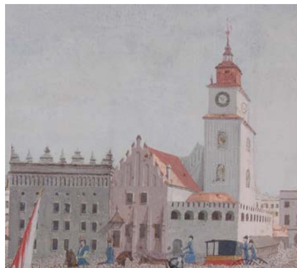
Fig. 7. The town hall (in the centre), the granary (to the left), the tower of the town hall and prison in 1794, as seen from the west. A part of the painting by Michał Stachowicz, The Historical Museum of the City of Krakow, record no. 786/VIII. All the buildings were plastered – the town hall was painted pink, the granary was grey, the tower and the prison were painted white

The Classicism marked its beginnings in the early 19 th century by introducing monochrome ideas, however, it did not abandon colour intensity. Images of the Market Square and the streets of Krakow (Figs 6, 8) show houses painted the same colours as before – olive, blue, carmine.