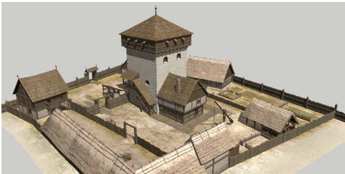
Fig. 2. The buildings on the premises of mayor Henryk at Bracka Street (circa 1300), reconstruction by Waldemar Komorowski and Piotr Opaliński. Walls of the central building on the plot – i.e. the stone tower in the centre of the plot – were plastered

Contemporary conservation projects, however, tend to maintain and justify this state. Careful renovation works were therefore carried out in the case of the wall in the chancel of the Church of St. Cross, where after conservation works of Hendel and Stryjeński there had been left odd mortar joints, previously not reported (subsequent conservation works maintained this conduct out of respect for old conservation methods). The town hall tower was exposed as brick and stone, although we do know its original look from before 1930 and earlier times. A proposal for partial recovery of the plaster was rejected by professor Wiktor Zin in 1997, though the professor himself found in the 1960s evidence of painted decoration covering the entire tower back in the 16 th century (Zin 1966: 123). This would be an effect of inertia or being used to aesthetics of a presumably plain medieval wall, which evokes different than contemporary and seemingly more archaic impressions.