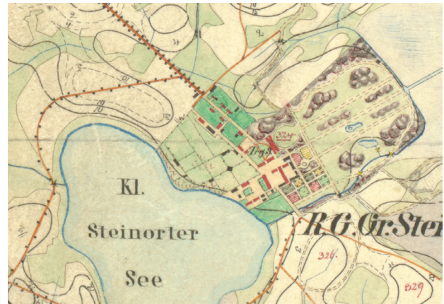
Fig. 10. Plan of the village from 1862.

The palace was depicted with four annexes, which correspond to the side wings and rear alcoves. The scale of the study did not allow for a correct representation of the kitchen tower (source: [30])