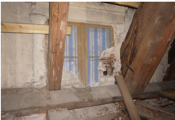
Fig. 8. The gable wall of the western wing, built as part of the first stage of the fifth phase. The brick and skeleton structure of the gable is visible, also repeated in the knee walls

Il. 8. Ściana szczytowa skrzydła zachodniego, nadbudowana w ramach pierwszego etapu fazy piątej. Widoczna murowano-szkieletowa konstrukcja szczytu, powtórzona również w ścianach kolankowych