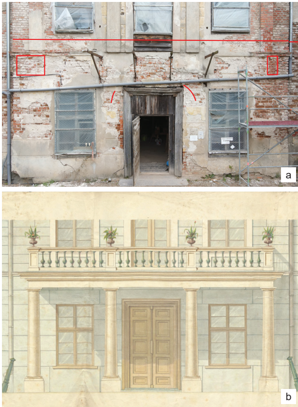
Fig. 6. Front avant-corps with the main entrance and balcony: a) current state with the remains of the three-centered arch, the level of the Baroque superstructure and point rebuilding in the zone of the balcony slab (photo by S. Bakalarczyk, 2023), b) design of the façade with a classicist balcony supported by Tuscan columns (source: [24])