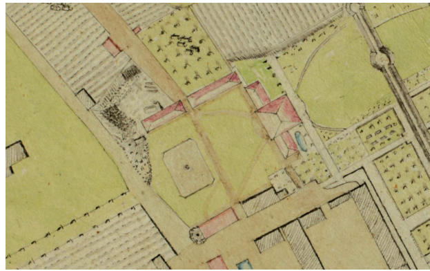
Fig. 5. The palace and its surroundings in 1809. Symmetrical side wings covered with gable roofs, reaching the side walls of the palace (source: [23])

Il. 5. Pałac wraz z otoczeniem w 1809 r.