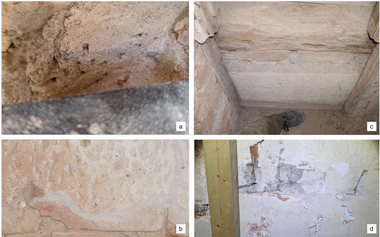
Fig. 3. Relics of the façade finish and roof covering, associated with the second chronological phase: