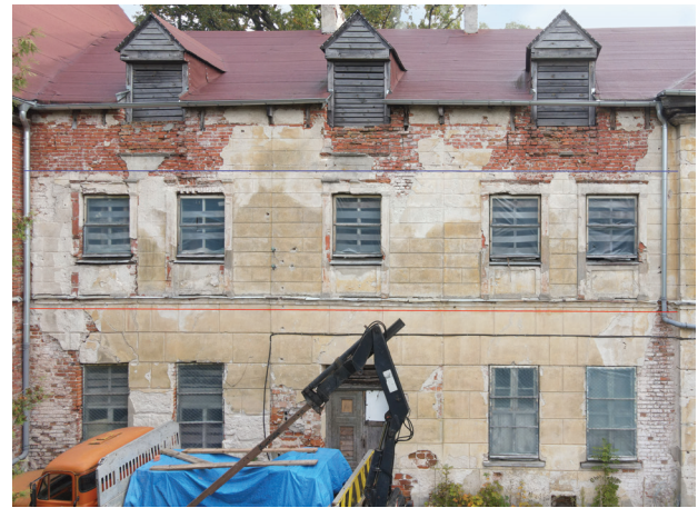
Fig. 7. The western wing has two levels of the superstructure that are clearly visible. Phases three through five.

There is no fourth phase in the eastern wing, the 1 st floor was erected together with the ground floor in the third phase