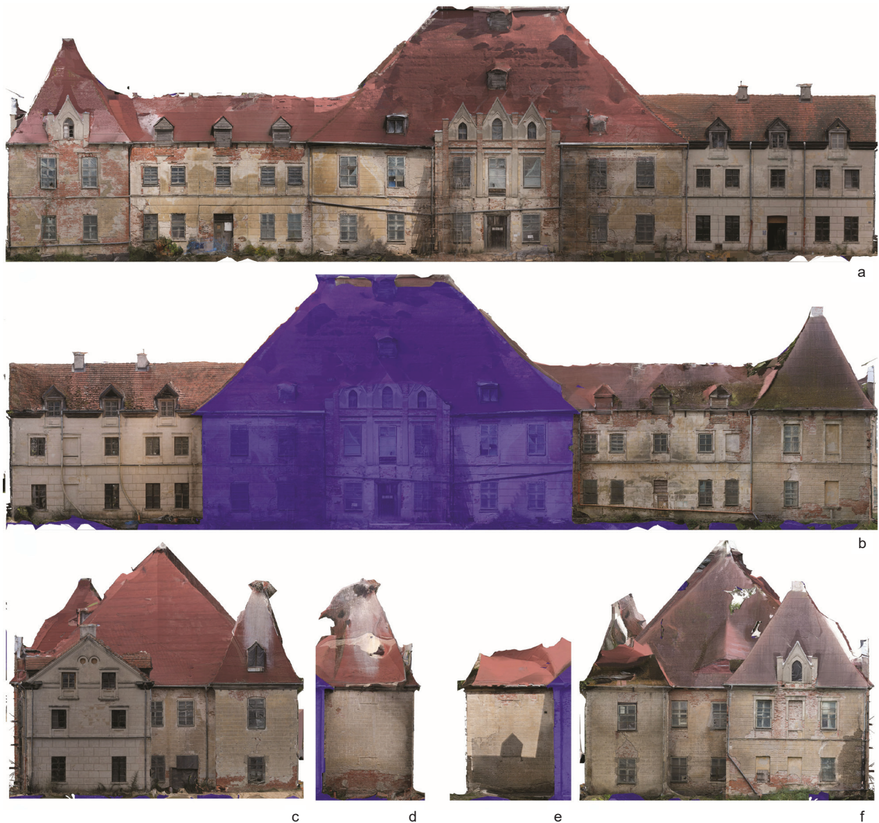
Fig. 1. View of the main façades of the building:

a) façade of the main nave and side wings (western façade), b) rear (eastern) façade of the side wings and kitchen tower, c) southern façade, d) western façade of the southern alcove, e) western façade of the northern alcove, f) northern façade (elaborated by S. Bakalarczyk, 2023)