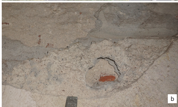
Fig. 9. Solutions characteristic of the fifth phase: a) the façade of the kitchen tower from the second stage of the fifth phase, referring in detail to the façade from the fourth phase (there are no traces in the homogeneous wall suggesting the later addition of neo-Gothic dormers), b) a well-preserved fragment of unpainted plaster with a rustication profile, used on the tower and the side and rear façades of the nave (the alcoves were prepared in the same way using lighter plaster)

Il. 9. Rozwiązania charakterystyczne dla piątej fazy: a) elewacja wieży kuchennej z etapu drugiego fazy piątej, nawiązująca detalem do elewacji z fazy czwartej (w jednorodnym murze brak jest śladów sugerujących na późniejsze dodanie neogotyckich facjatek), b) dobrze zachowany fragment niemalowanego tynku z profilem boniowania, zastosowanego na wieży oraz elewacjach bocznych i tylnej korpusu (w ten sam sposób opracowano alkierze przy użyciu jaśniejszego tynku)