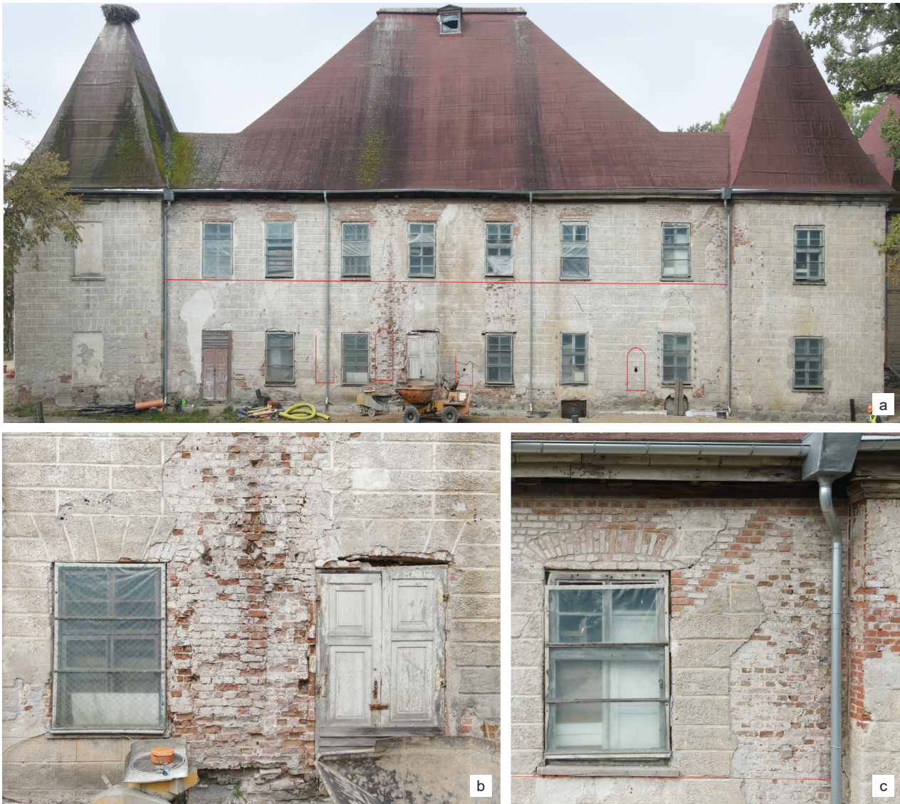
Fig. 2. The rear façade of the nave with the alcoves, which were added in the third stage of the fifth phase: a) the average border of the walls from the first and second phases and the location of the arcaded niches are marked on the view, b) a close-up of the most visible niche by the door to the garden living room (it has chiseled edges below the arch; both the window and the door have rebuilt lintels and glyphs), c) the 1 st floor window with a clearly legible three-centered arch of the lintel.

Below the window sill, the border of the walls of the first and second phase is visible