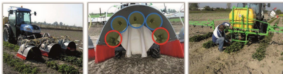
Figure 1. (the left hand one). Multi-tunnel sprayer Klip Klap (Denmark)