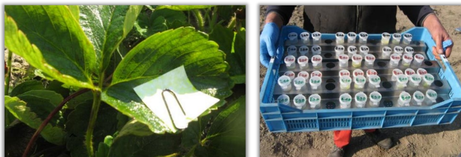
Figure 4. (the left hand one). Method of attaching filter paper samples to the leaves

Double-jet nozzles: TJ60 80 (double-jet flat fan) and DGTJ 110 (double-jet flat fan with drift protection) and single-jet flat fan nozzles: AIXR air-inclusion and XR 80 extended pressure range were used in the study. The operating parameters of the sprayers and the codes of the nozzles are shown in Table 2.